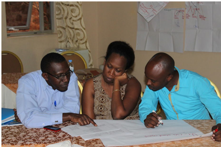
SCAB/EU staff and partners during a group discussion at the inception launch

Strengthening CSO in Agriculture Policy and participatory Budgeting (SCAB) project Funded by the European Union is a new project that will be implemented by ActionAid International Rwanda together with its partners CCOAIB and CLADHO. This is a capacity building project targeting Civil Society Organizations(CSOs)& Community Based Organizations(CBOs) that are in agriculture to participate in agriculture policy shaping, implementation, monitoring and evaluation and advocate for changes where necessary.