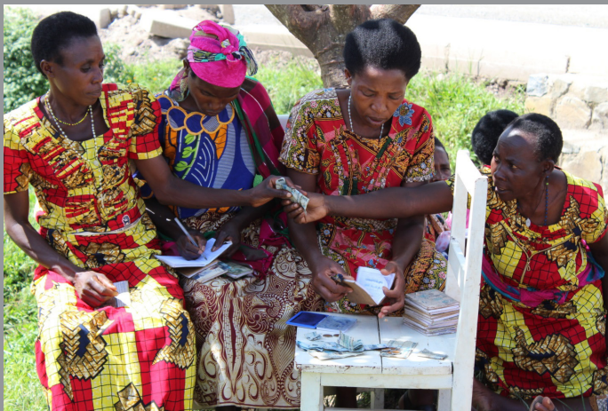
Women in Muko sector based cooperative during the weekly savings activity