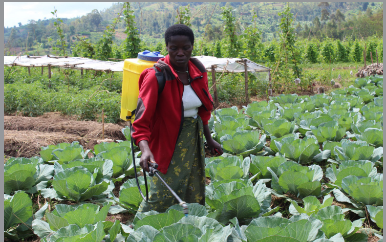
A right holder under the IFS MUKO project watering her vegetables