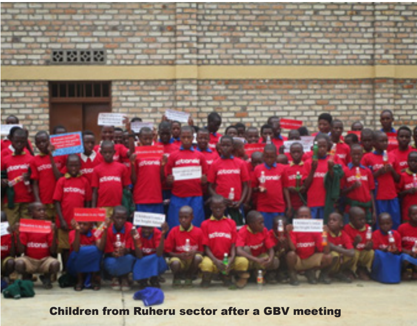
Children from Ruheru sector after a GBV meeting