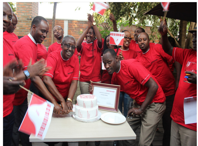
AAR Country Director and staff cut cake in celebration of becoming an ASSOCIATE

ActionAid, Rwanda recently moved from being a Country Program to an Associate and is now a member of the ActionAid Federation. This milestone achievement was announced on 23-06-2016 during the Annual Directors' Forum & General Assembly in Maputo.