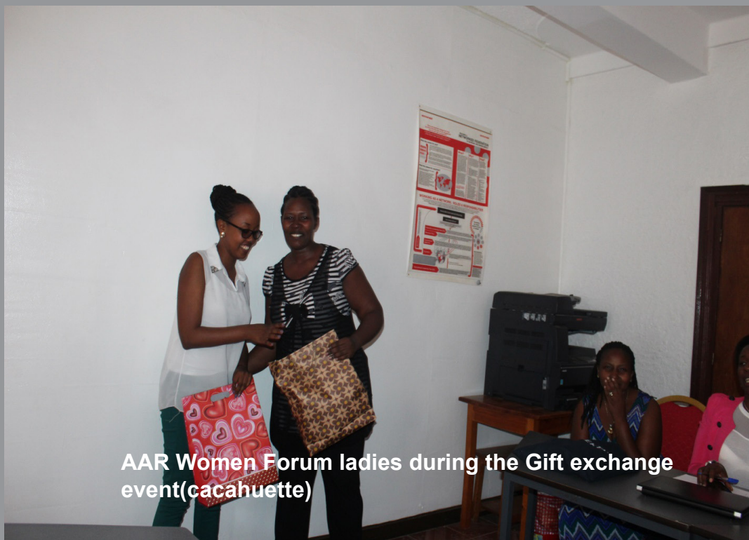
AAR Women Forum ladies during the Gift exchange event(cacahuette)