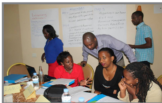
AAR staff during a group discussion at the inception launch

AAR has worked on a similar project before known as Public financing for Agriculture (PFA) meant to advocate for increased investment for agriculture whereas SCAB builds the capacity of CSOs to participate in agriculture budget planning process to eventually influence agriculture policy shaping or advocate for policy changes.