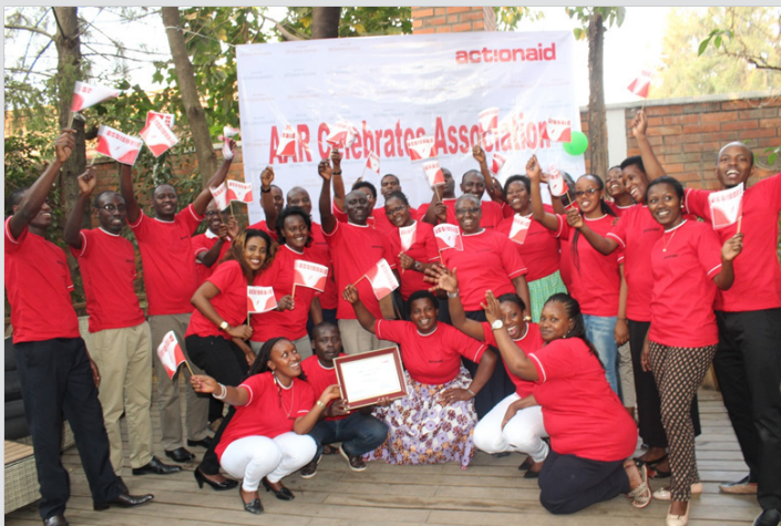
AAR staff raise flags during the celebration