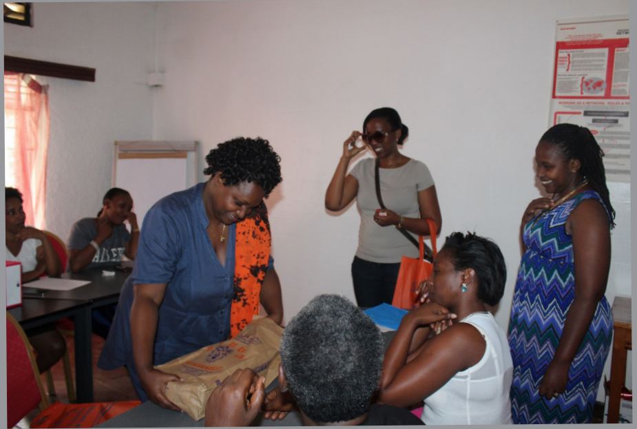
Some of the AAR Women Forum members cheerfully exchanging gifts