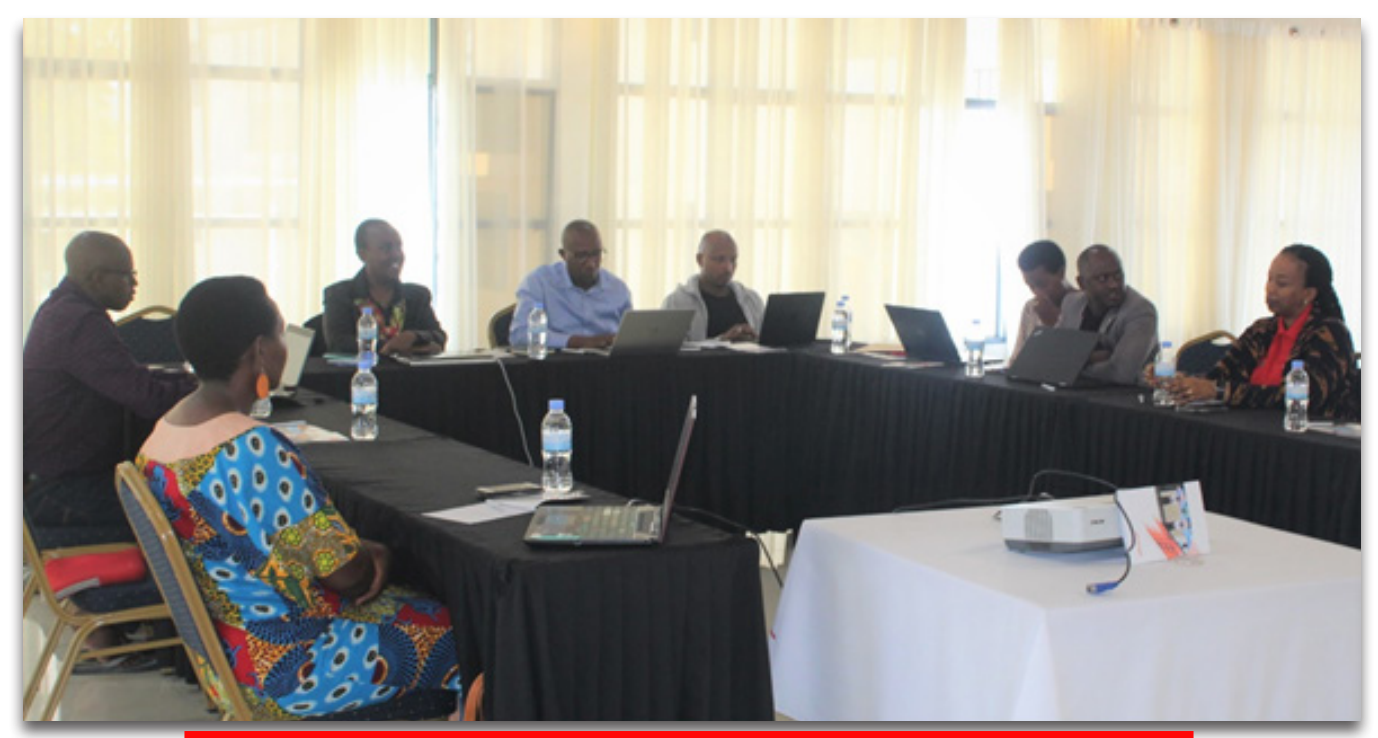
AAR Board Meeting at Quiet Haven Hotel in Nyanza District, Dec 2022

As part of its continuous self-assessment and effective planning, ActionAid organizes end of year review and sets targets for the new year. It is this view that on18th December 2022, happened the End of Year AAR's Board meeting at Quiet Haven Hotel in Nyanza District to reflect on 2022 performance, check off important end-of-year activities & plans for the next year of 2023. The Board of Directors used that opportunity to wish Merry Xmas & Happy New Year 2023 to the Management and staff of ActionAid Rwanda.