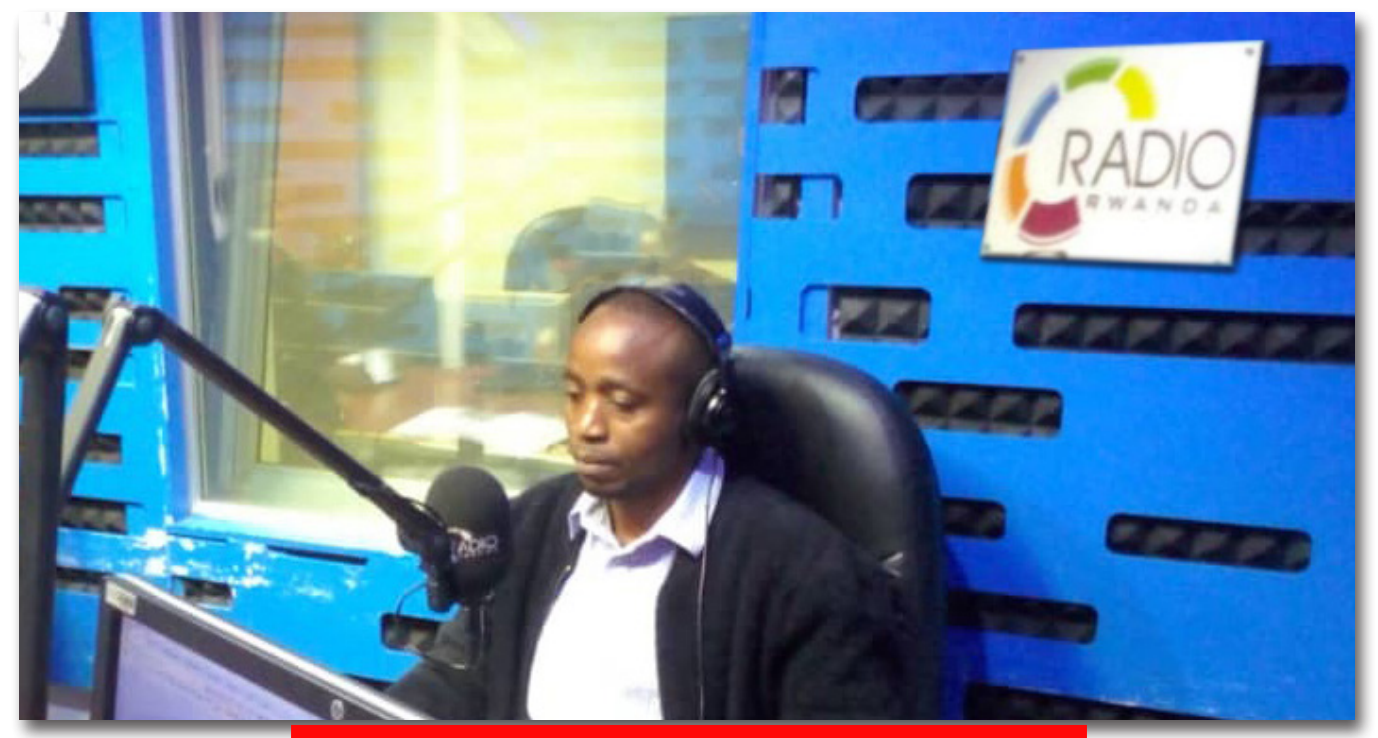
AAR Awareness Campaign on SRHR at Radio Rwanda

In the same view, from 11th up to 18th Nov 2022 ActionAid Rwanda under this project, conducted a campaign to raise public awareness on ways to combat GBV and teen pregnancies to increase the knowledge of parents or guardians around sexual and reproductive health rights and also to encourage young people to utilize available SRHR services. The campaign gathered more than 1000 people from Kinyinya and Rusororo sectors in Gasabo District and Gitesi and Rugabano sectors in Karongi District.