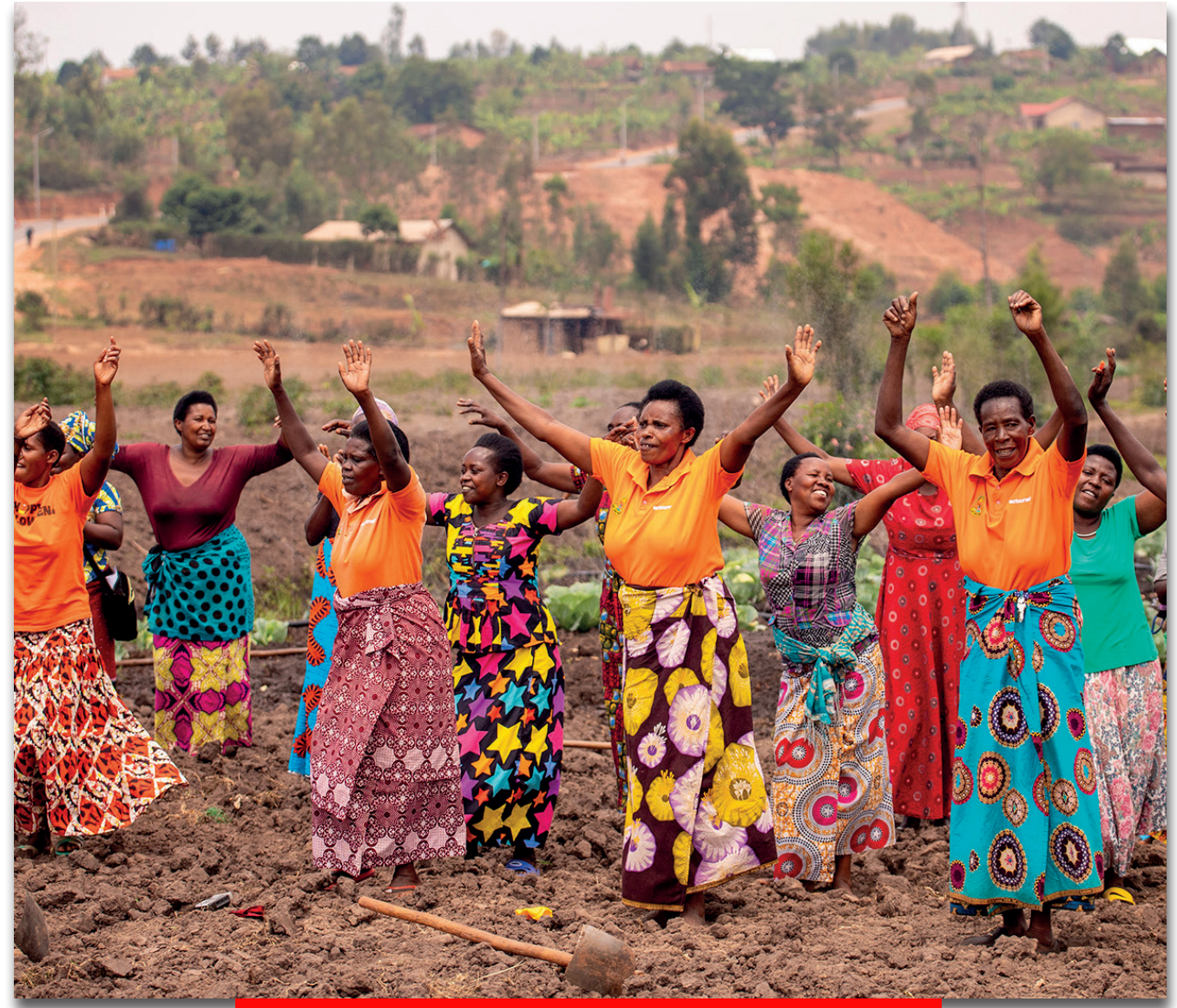
Women in Rwanda confront Loss and Damage

This research was conducted in Rwanda, Kenya, Zambia and Nigeria and highlighted that in 2022, the losses and damages caused by climate change are escalating faster than predicted and with increasingly devastating consequences.