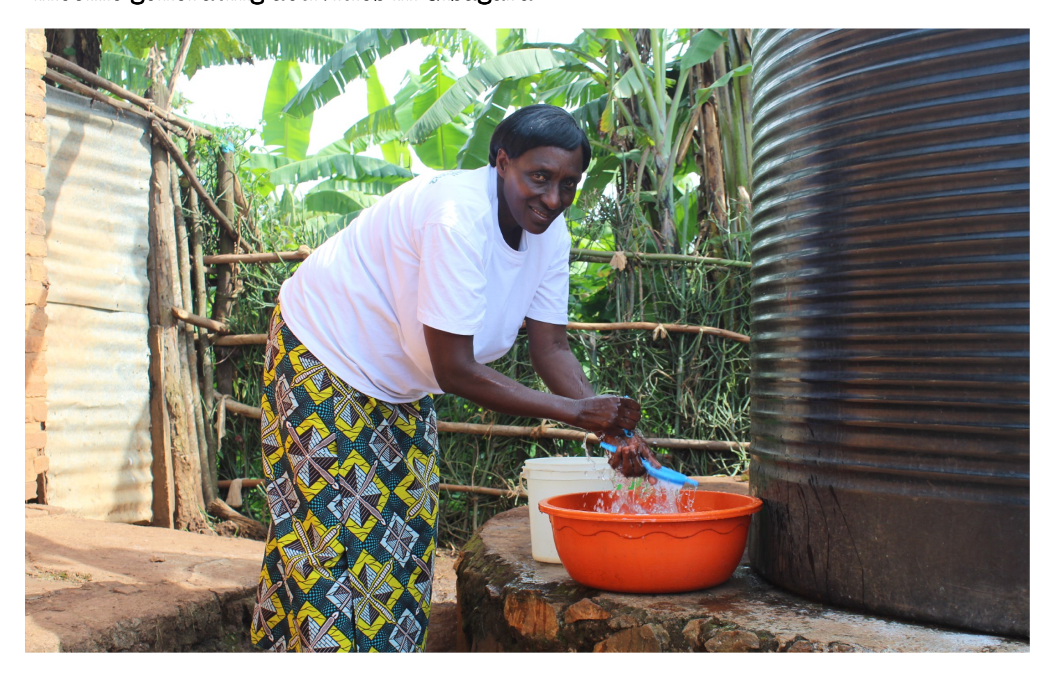
By Theogene Uwiringiyimana

Water facilities provided by ActionAid promoted women's participation in income generating activities in Gisagara