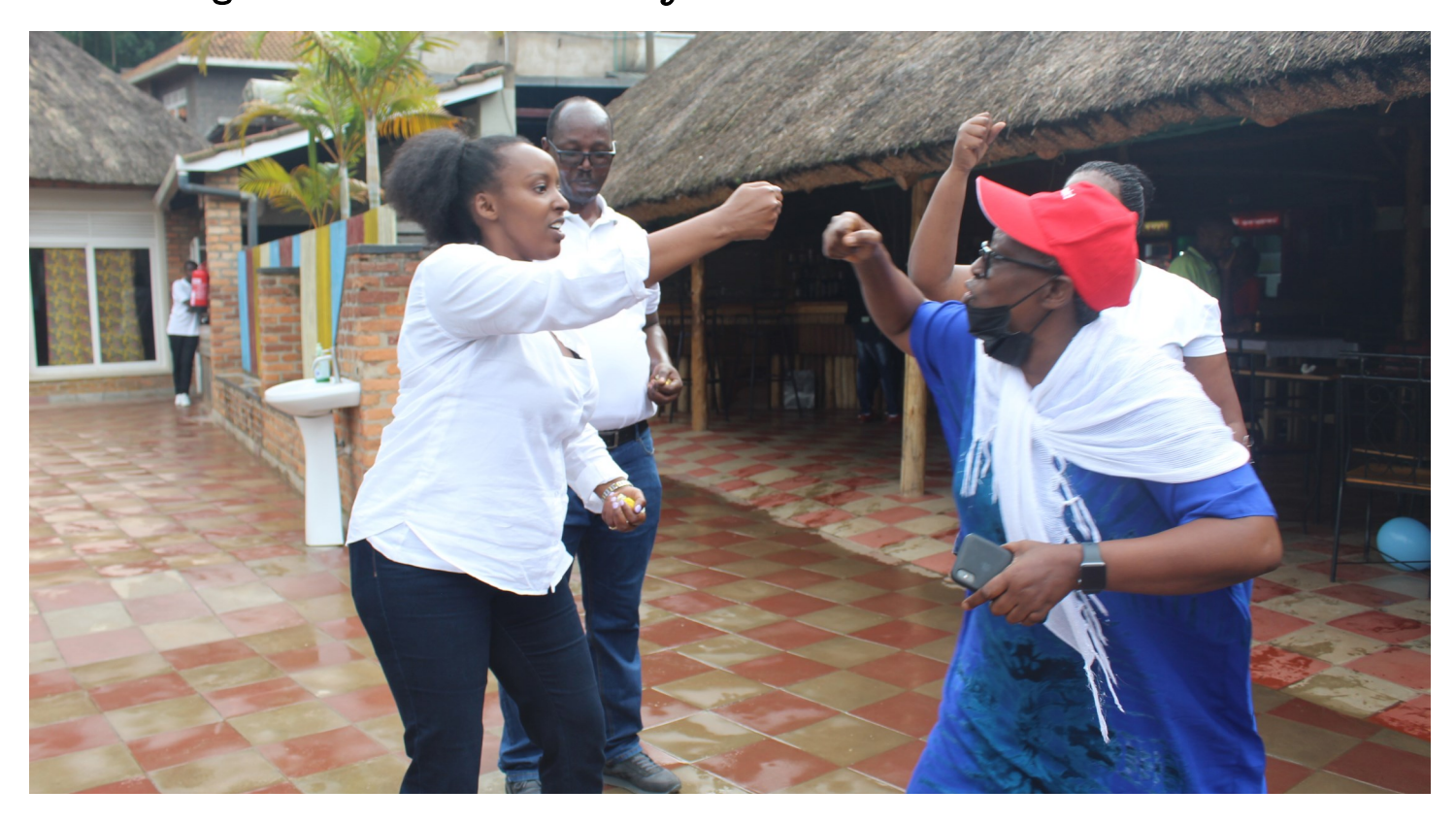
By Theogene Uwiringiyimana

Teamwork highlighted for employees' productivity as ActionAid Rwanda celebrating International Labour Day