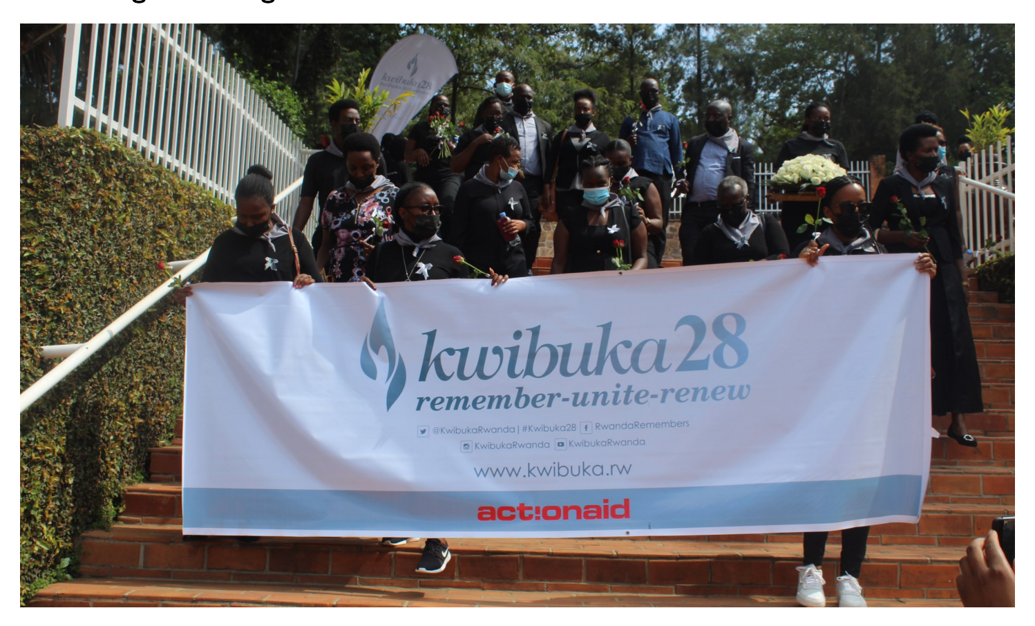
By Theogene Uwiringiyimana

ActionAid Rwanda supported 5 families of former Aide et Action employees killed in genocide against Tutsi