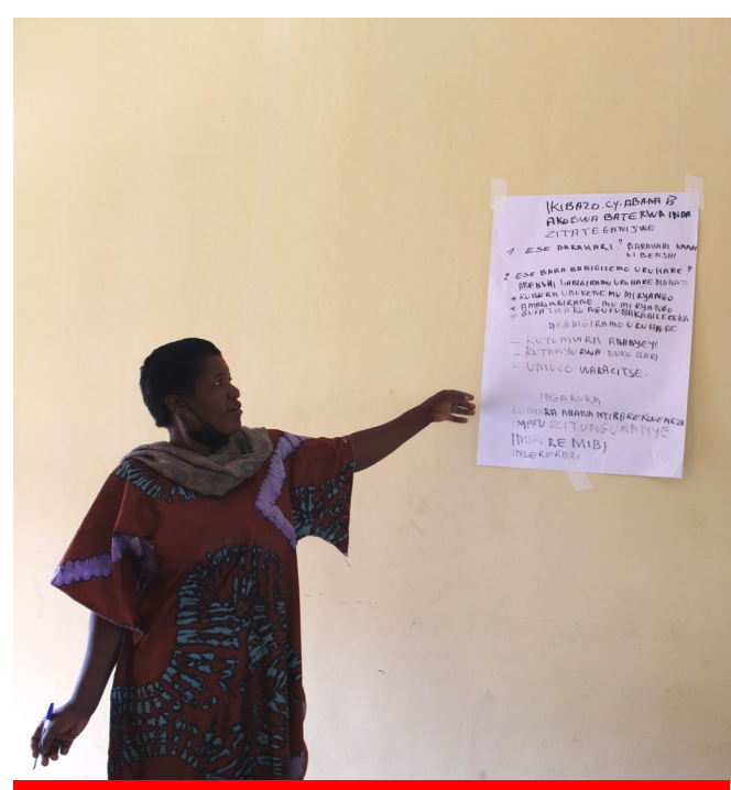
Participants shared skills on laws protecting families

"I am now committed to teach other group members on this Laws because this will help so many women to fights for their rights and able to claim for it, I will advocate for women's rights as I know laws that can be used to protect for women's rights when violated" she added.