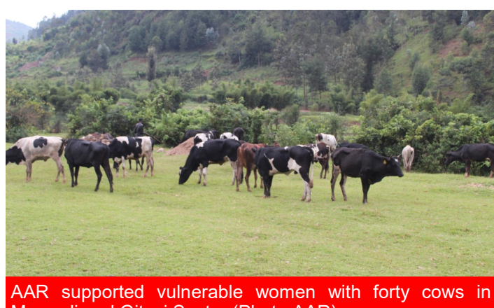
Murundi and Gitesi Sector

In this fiscal year, Karongi District has pledged to provide 550 poor families with cows, and this pledge has been achieved hundred percent. Among these 550 cows include donations from local partners and 40 cows provided by ActionAid Rwanda in two sectors of Gitesi and Murundi where it operates.