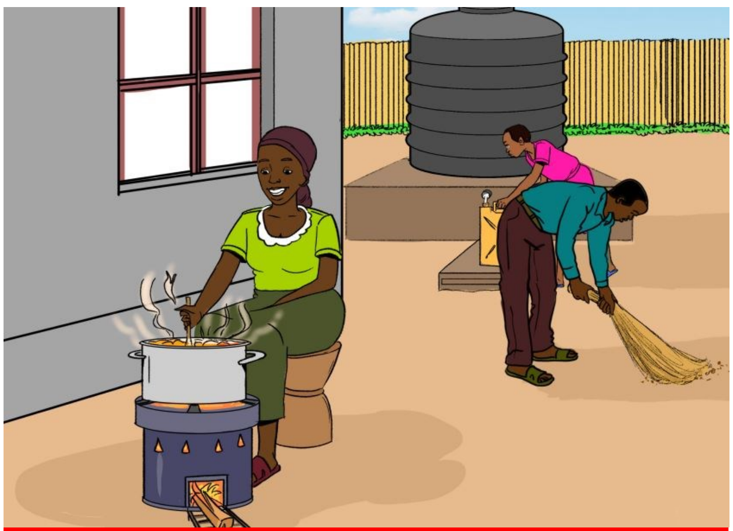
The illustration designed by ActionAid Rwanda showing all family members sharing home caring works in raising awareness to unpaid Care Works (Illustration by ActionAid Rwanda)

ActionAid Rwanda in advocacy to end patriarchal and cultural beliefs that hinder family's development