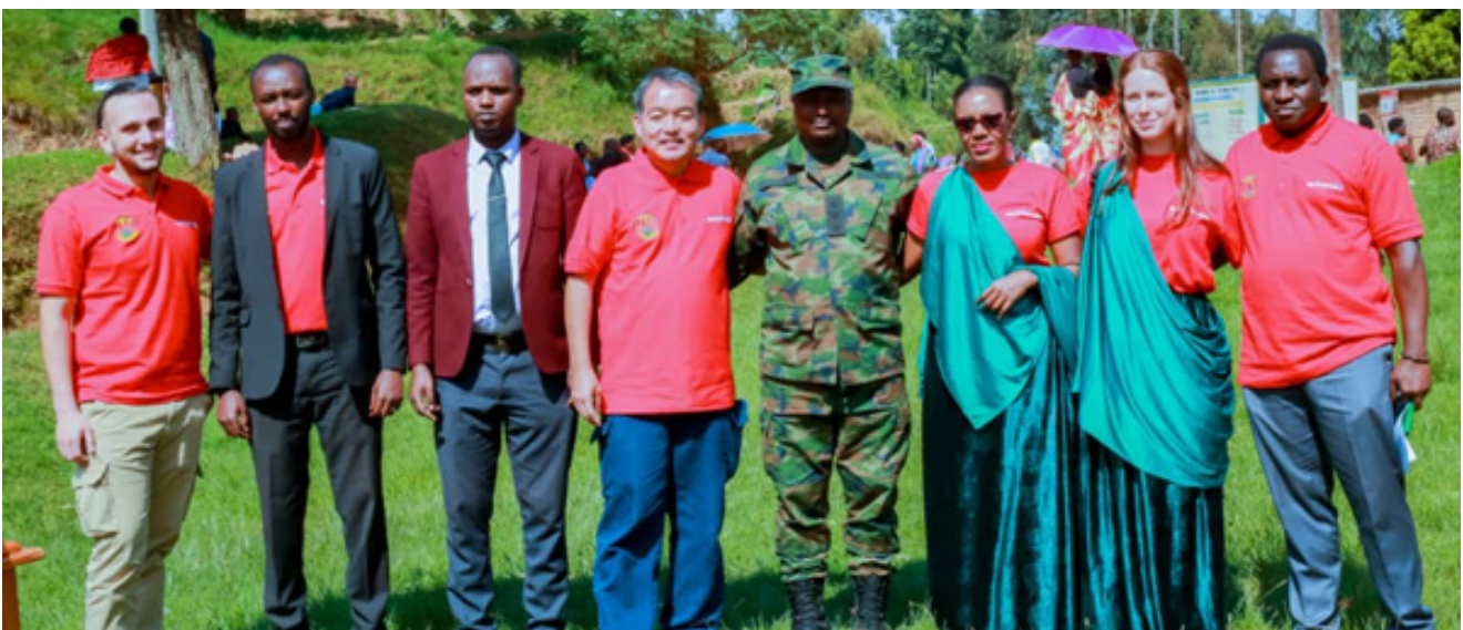
AAR Photo: stakeholders joined the residents of Ruheru to celebrate IWD2023

In the Ruheru Local Rights Programme, AAR celebrated IWD2023 which was attended by 964 people including District Officials, representatives from CSOs, PSF, religious organizations and citizens of Ruheru. ActionAid Rwanda supported women members of WLCP with 6 smart phones to facilitate them to exchange information on issues that affect them including reporting GBV cases to relevant authorities and to adapt to digital, ICT and innovation for gender equality and greater economic and social development. Women also supported fellow women with cows to get milk to address malnutrition and manure to boost their agricultural production.