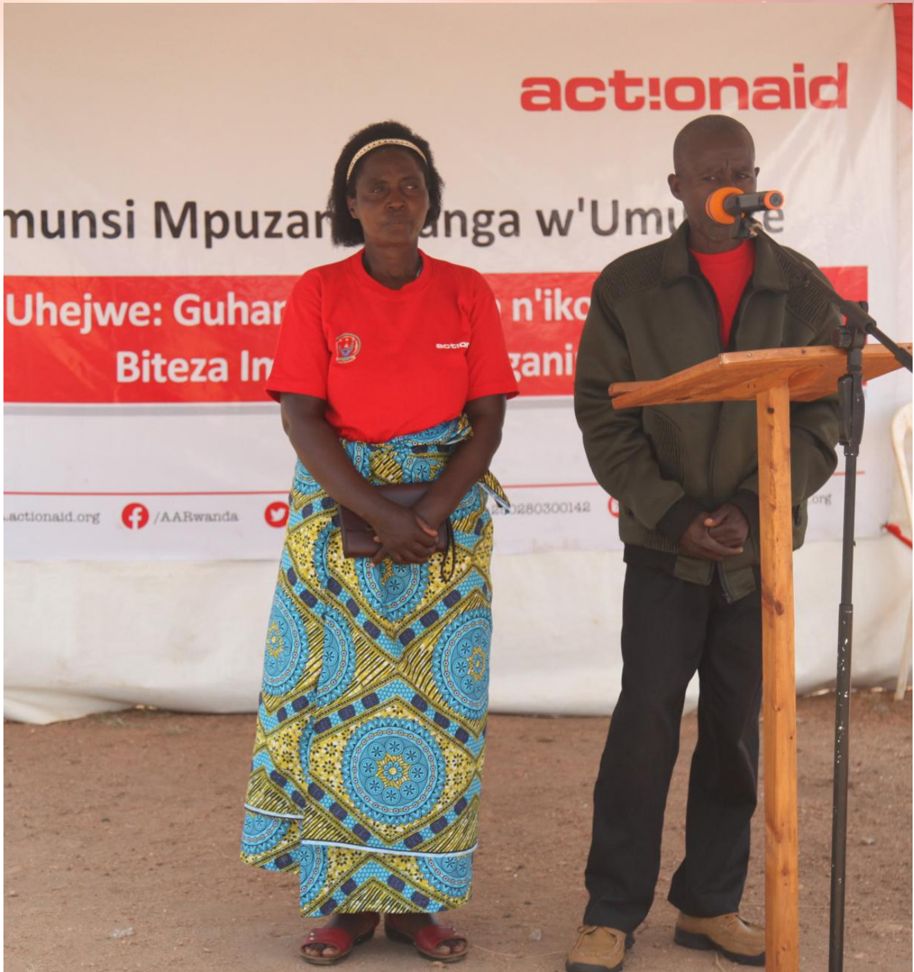
A couple testified how they benefited from the AAR anti GBV Program and now live in peace and harmony

Through the use of body maps, capati diagram and power dynamic representation games, women facilitators educated the public about the barriers faced by women that affect their socio-economic development, including lifelong negative consequences of unpaid care work.