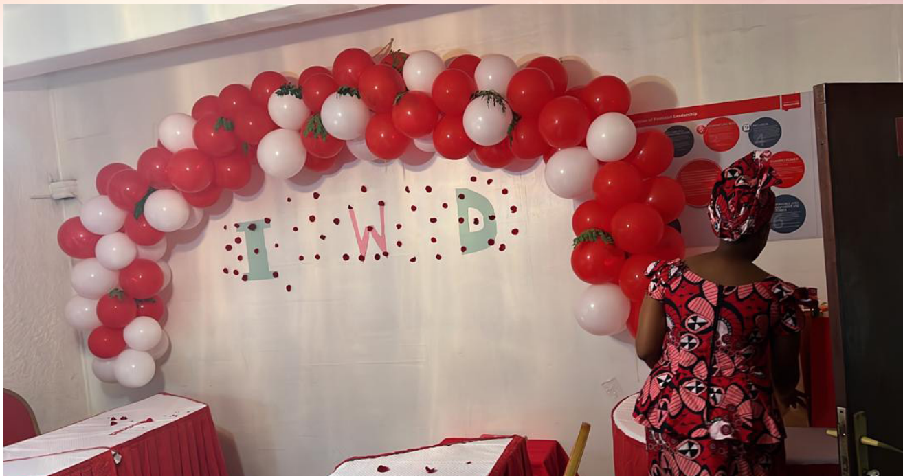
Women's Day arch as AAR staff was celebrating IWD2023

After joining the rest of the world to celebrate the IWD02023 and marking it in all Local Rights Programmes, AAR staff celebrated IWD2023 internally, reflected on the incredible contributions of women to society and reaffirmed their commitment to strengthen interventions that promote gender equality