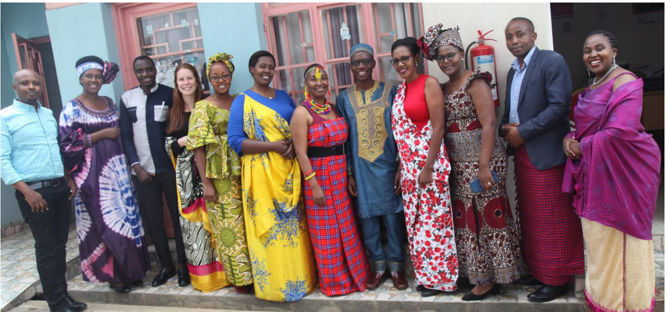
AAR staff attended IWD2023

Joined by their AAR male employees, they recognized their female colleagues for their great contribution to promoting gender equality in Rwanda.