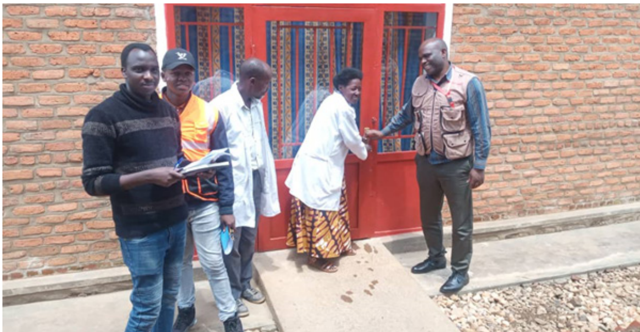
AAR hands over girls' room to support girls' education in Karongi

AAR advocates for girls' safe rooms to promote girls' education and, as has been proven in different schools, girls' safe rooms prevent school absenteeism among girls and help them feel more comfortable at school when they are in menstruation periods.