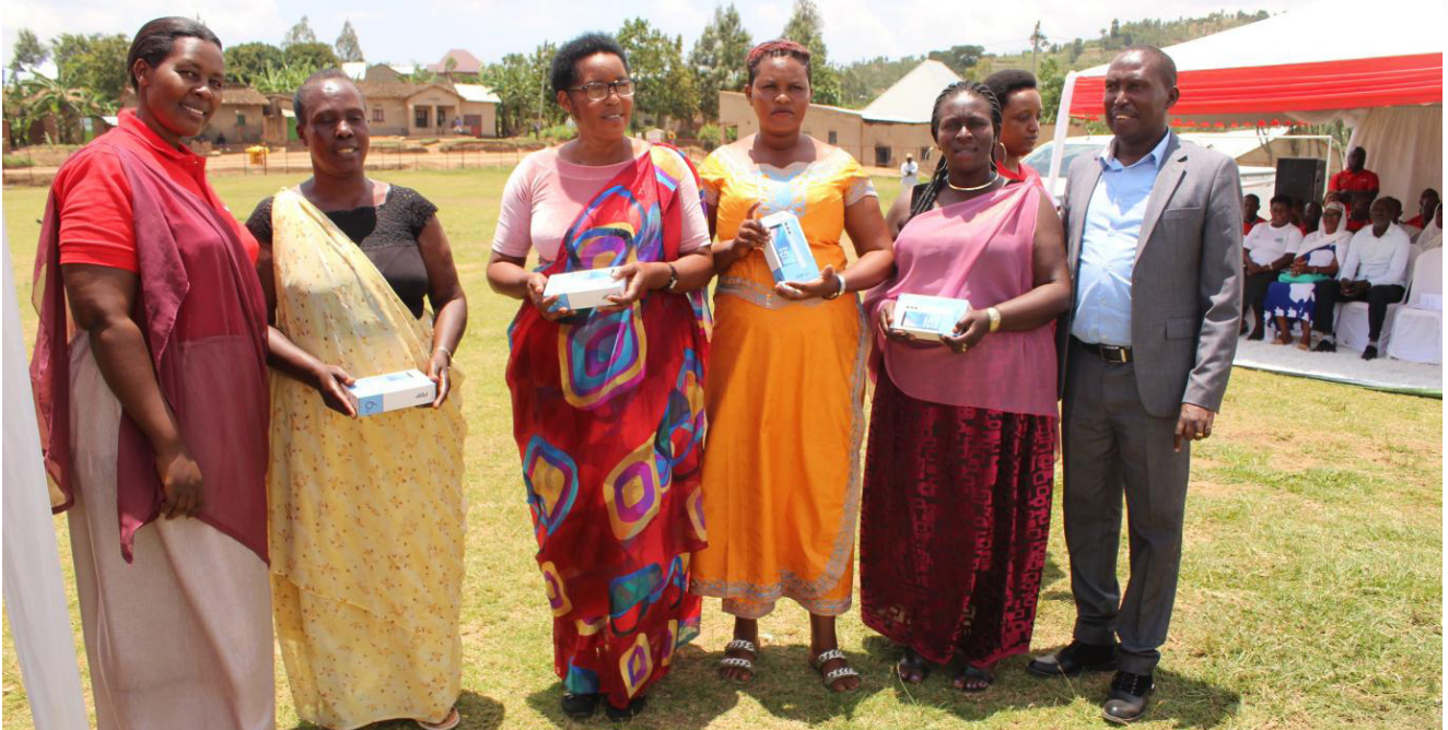
In Busasamana/Nyanza Dist. ActionAid Rwanda supported women with smart phones during IWD2023 to adapt to Digital, ICT and innovation to advance gender equality and technology

In Nyanza, ActionAid Rwanda supported 6 women from Busasamana sector with 6 smart phones to facilitate them to exchange information on issues that affect them including reporting GBV cases to relevant authorities and to adapt to digital, ICT and innovation for gender equality and greater economic and social development. This will also help to reduce the existing digital gender divide.