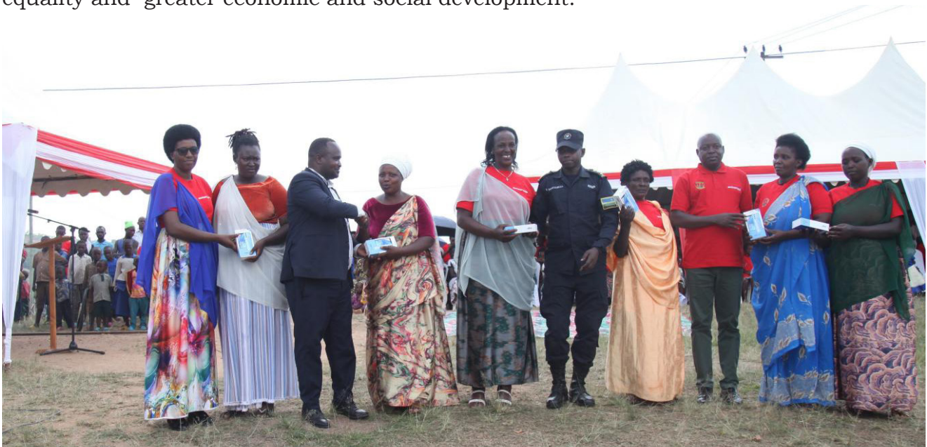
AAR supported women with smart phones to adapt to digital, ICT and innovation for gender equality

Hence, IWD2023 was attended by 650 people and Actionaid Rwanda supported women with 6 smart phones to exchange information on issues that affect them including reporting GBV cases to relevant authorities and to adapt to digital, ICT and innovation for gender equality and greater economic and social development.