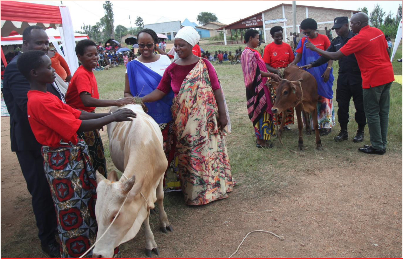
Women donated two cows to fellow women through a community cycle of gift (cow) giving (Kuremera)

There followed supporting women by donating two cows to poor families through the community cycle of gift (cow) giving (Kuremera) and Girinka Program. Women also supported fellow women from families with food insecurity with food stuff.