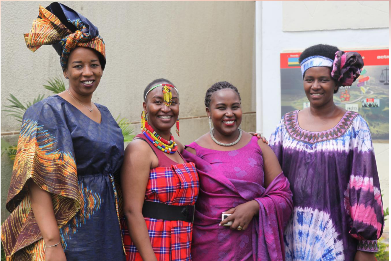
AAR staff attended IWD2023

Joined by their AAR male employees, they recognized their female colleagues for their great contribution to promoting gender equality in Rwanda.