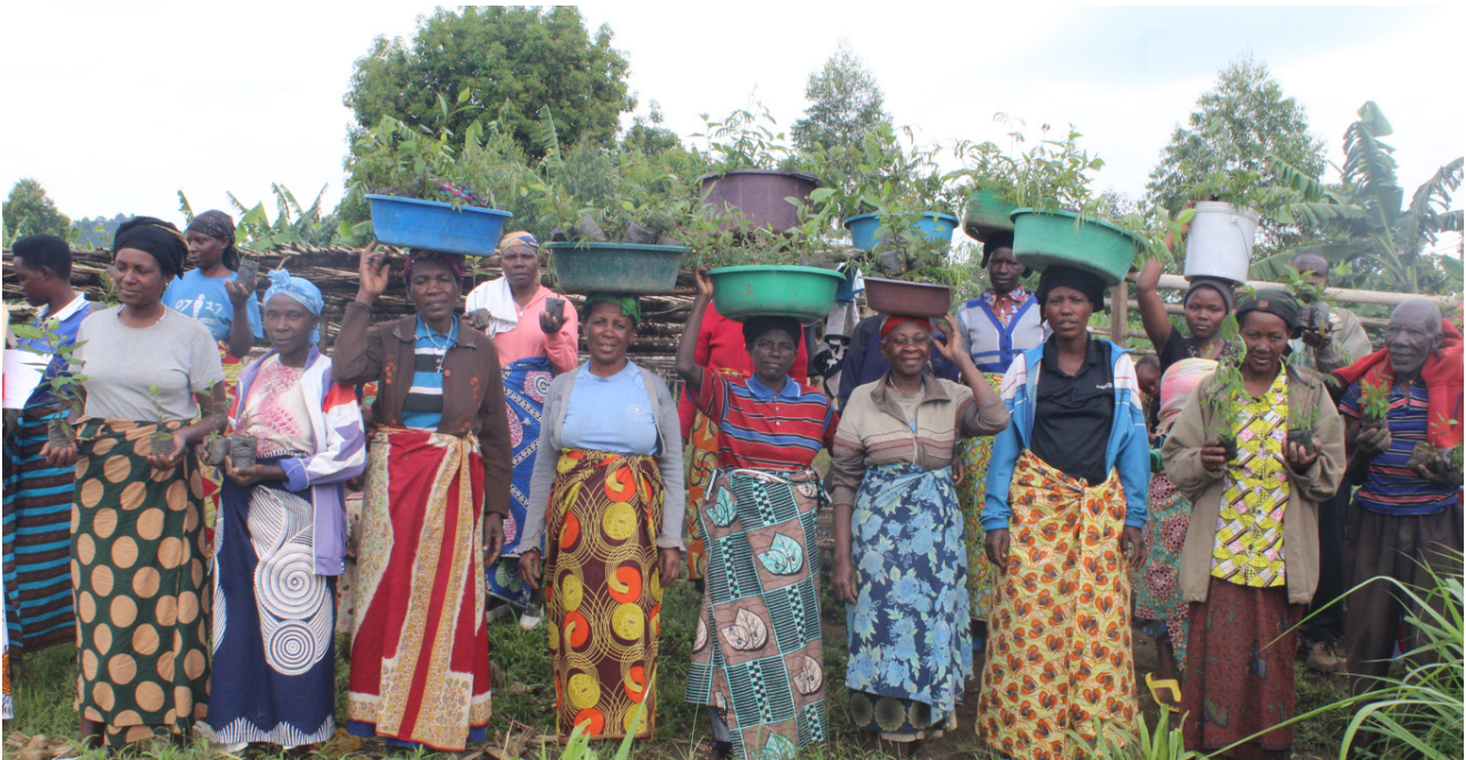
Women in Musanze supported with Agroforestry trees to combat soil erosion

In a view of strengthening a resilient livelihood and food security, on 2nd February 2023, AAR supported 72 Women cooperatives in Muko with Agro-forestry trees seedlings that can be planted along with other crops to combat the impact of climate change. They also contribute to minimizing the effect of soil erosion, being used as animal feeds, sell them for cash as well as using them as stakes for climbing beans. This comes after AAR had supported Right Holders in Muko with a community tree nursery bed in 2022.