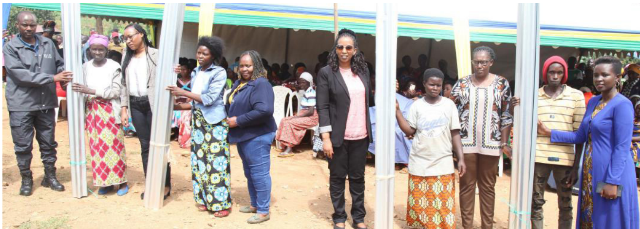
AAR supported women with 1205 iron sheet to roof their shelters at the closure of Women’s Month, March 2023

Following the International Women’s Day that was celebrated on 8th March 2023, ActionAid Rwanda participated in the Women’s Month and its concluding that took place in Kigoma Sector of Huye District. ActionAid Rwanda supported 50 vulnerable women families with 1205 iron sheets to roof their shelters in order to address recurrent human security issues