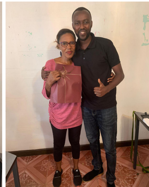
Cacahuete friends offering each other gifts