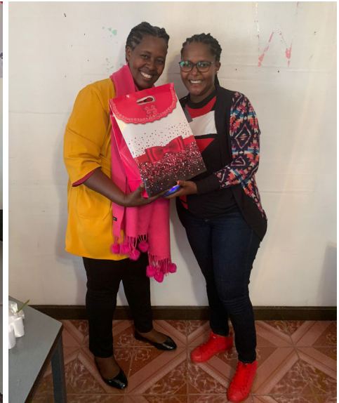
AAR Photo: Cacahuete friends offering each other gifts