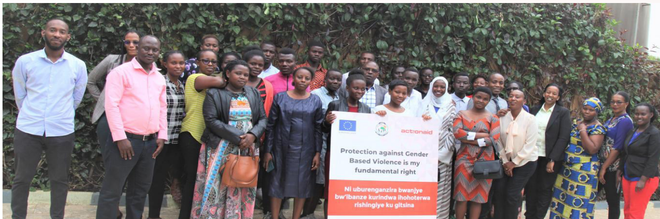
AAR staff and partners attended the training

In February 2022, ActionAid Rwanda, in partnership with Faith Victory Association started the implementation of a 2-year project: Empowering Young people to prevent and fight SGBV in Rwanda.