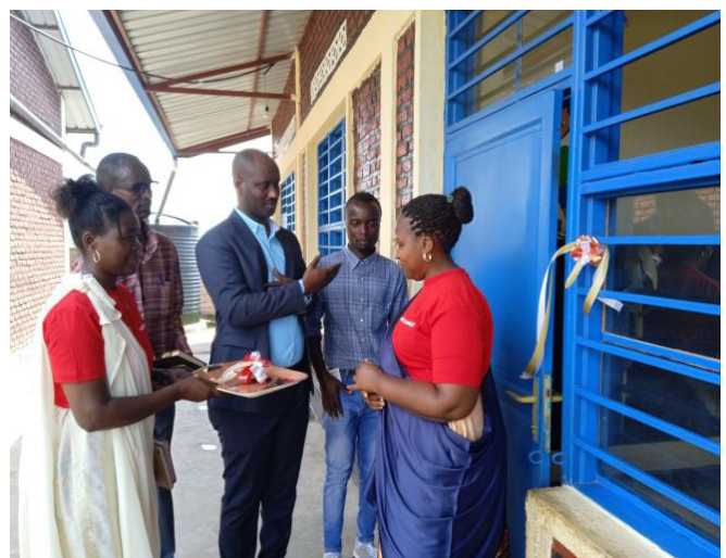
AAR handing over of classrooms in Musanze District