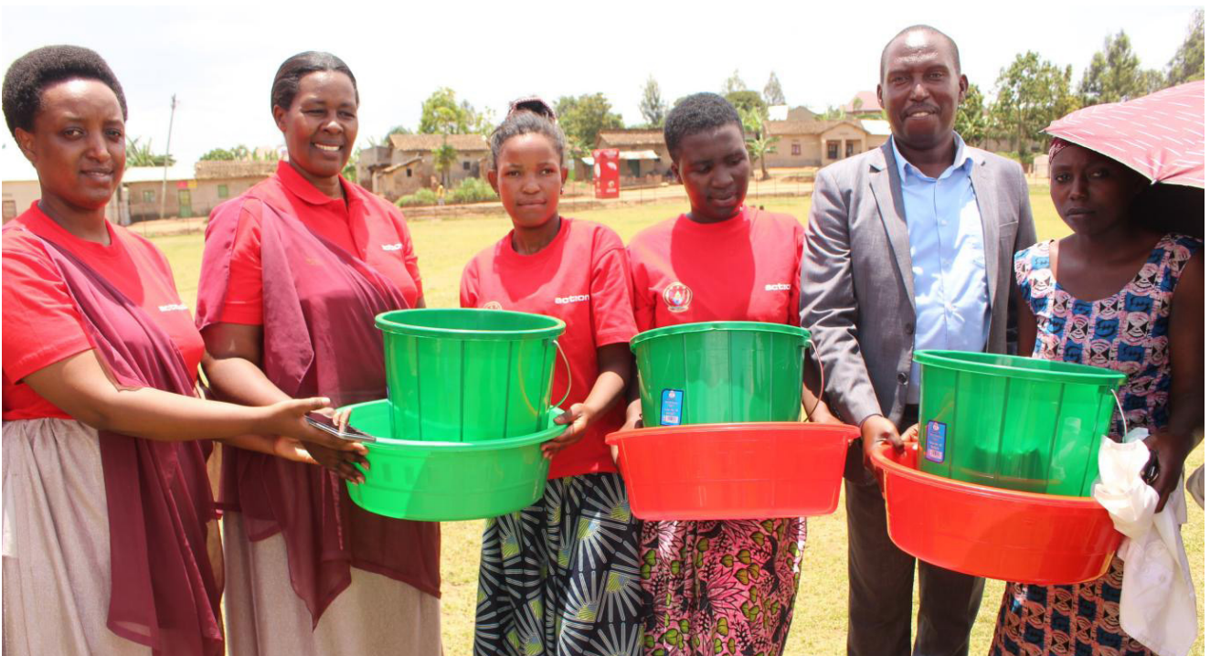
In Murundi/Karong Dist. ActionAid Rwanda supported women with hygienic materials

Also, Actionaid Rwanda supported 100 teen mothers with hygienic materials such as sanitary pads, Vaseline, soaps, buckets, basins to support them improve their hygiene as well as for their children. Other stakeholders also supported community members with food items to feed their families.