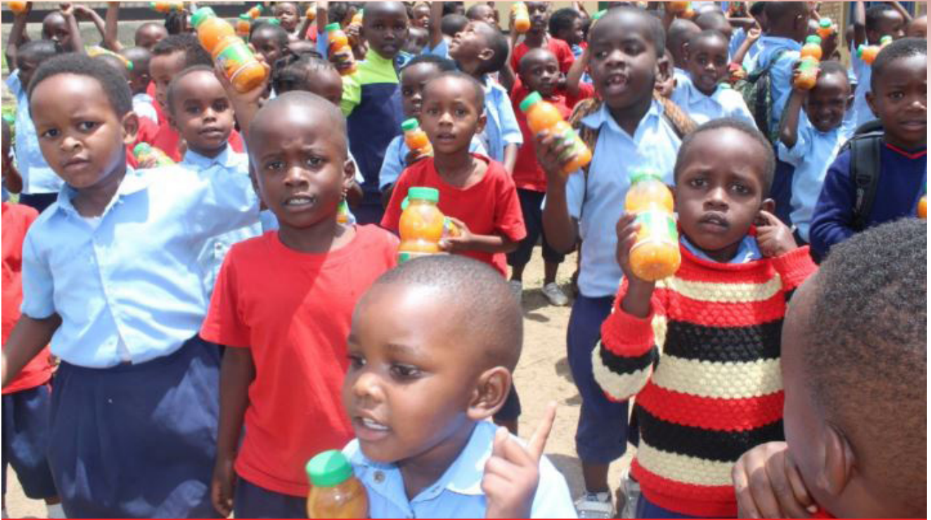
AAR organized children's Fun Event in Nyanza

The overall objective of this activity was to support children's talent development competitions in poems, drawings, songs, plays, games, and fun related activities and raise awareness of children's rights and issues affecting them in the community. The Fun event was an opportunity to share food and drinks, inspire their school retention and greater performance at school.