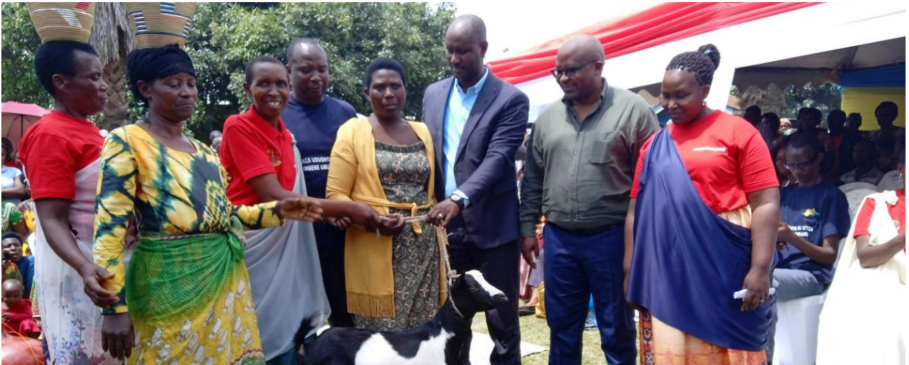
AAR supported women with livestock in Muko/Musanze District

Inspired by the culture and approach of ActionAid to empower the communities to improve their livelihood and impact on individual lives, women cooperative members in Shingiro also supported fellow women with 20 cell phones for women to adapt to Digital, ICT and innovation for gender equality. Women to women support also included 376 kgs of maize, 20 hoes, goats, sheep, etc.