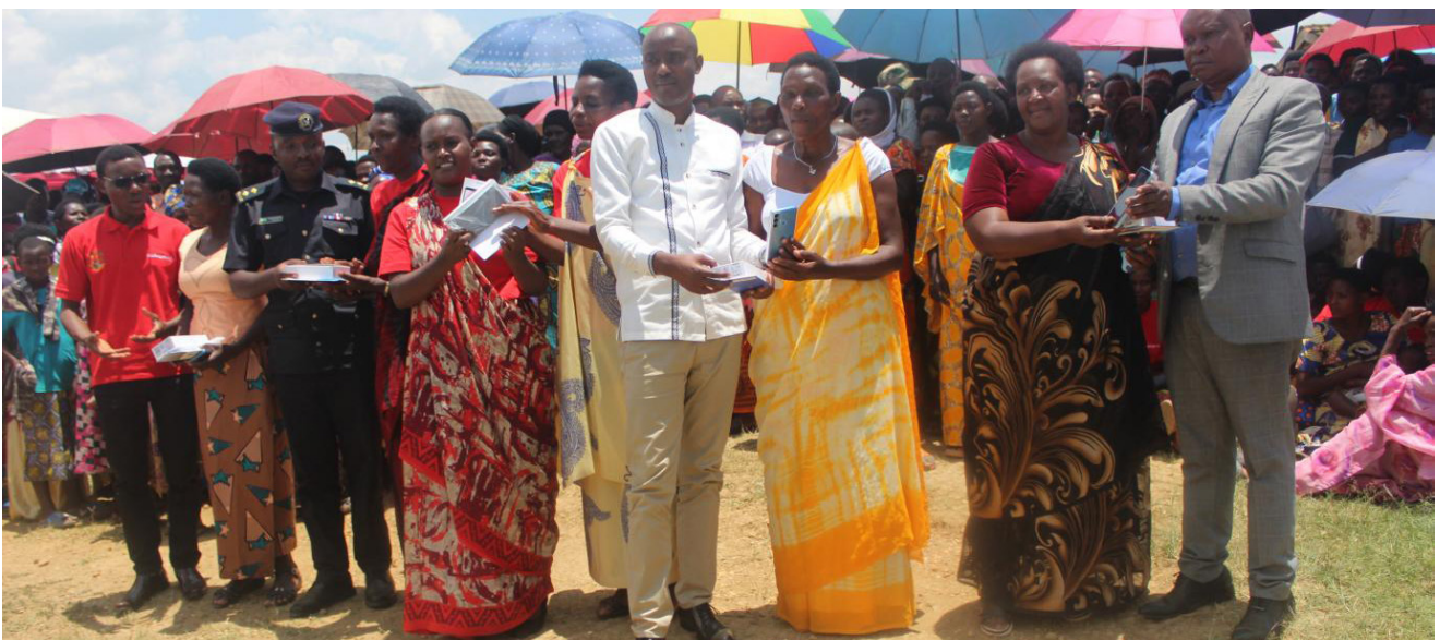
In Murundi/Karongi District. ActionAid Rwanda supported women with smart phones during IWD2023 to adapt to Digital, ICT and innovation for gender equality

ActionAid Rwanda also celebrated IWD2023 in Murundi Local Rights Program and was attended by 700 people. AAR supported 11 women, including Women Led Protection committee members, with 11 smart phones and 4 radios in order to facilitate them to exchange information on issues that affect them including reporting GBV cases to relevant authorities and to adapt to digital, ICT and innovation for gender equality and greater economic and social development. 15 families also legalized their marriages with the view to minimizing family conflicts and gender-based violence.