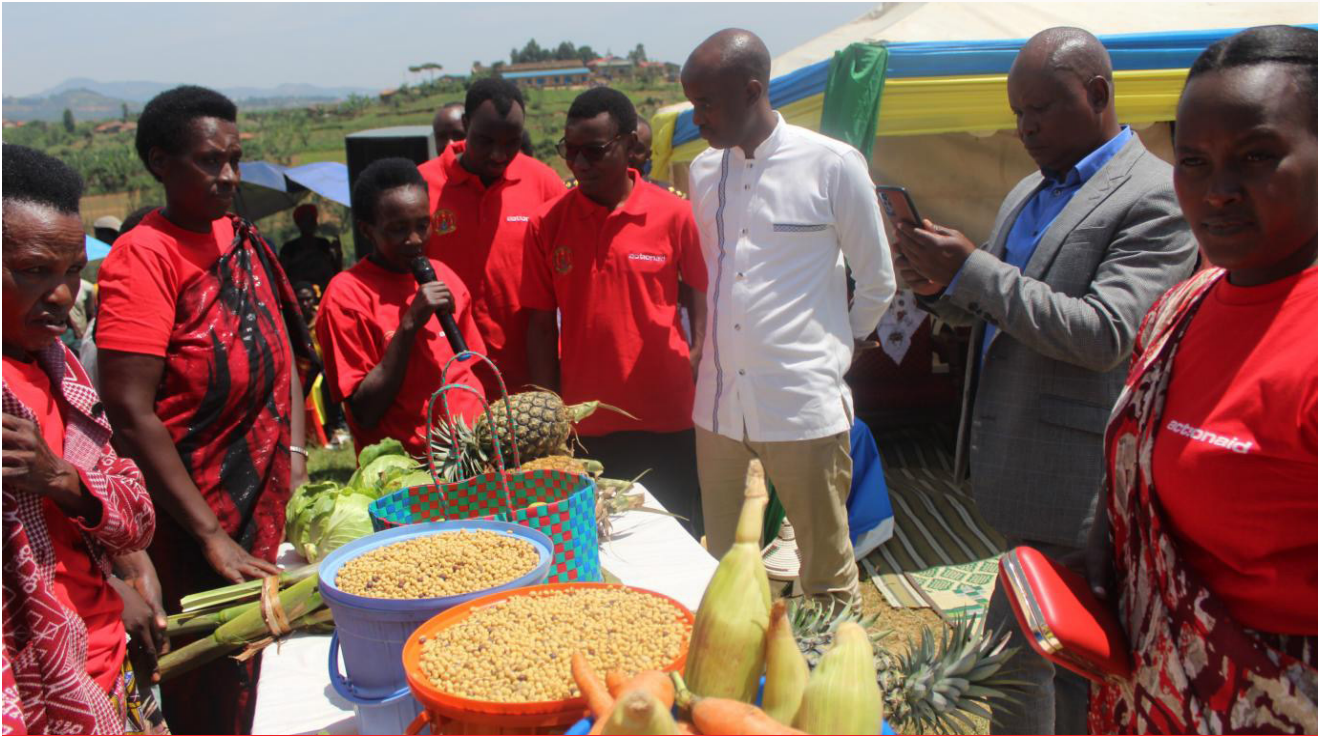
In Murundi, IWD2023 was started by an exhibition showcasing Women's agricultural production and efforts towards food security

The event was started by a women's exhibition showcasing their agricultural production and efforts towards food security. Two women also supported their fellow community members through a community cycle of gift (cow) giving (Kuremera) and Girinka Program.