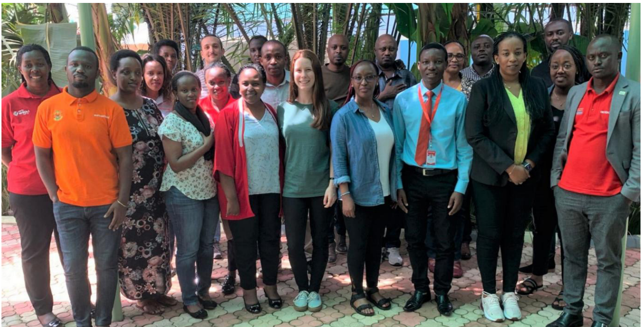
AA Photo: AAR staff attended the trainings

In view to building the capacities of AAR staff in human resource and Organization policies, safeguarding, fundraising, AAR organized training and workshops to empower its staff with necessary knowledge and skills to perform better, increase their productivity as they have become experts in those fields.