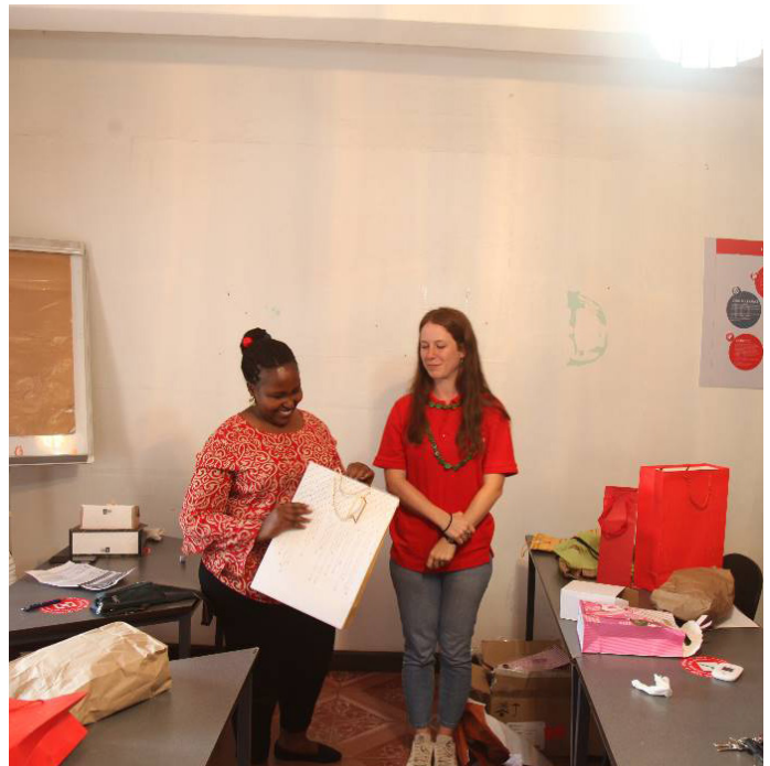
Cacahuete friends offering each other gifts