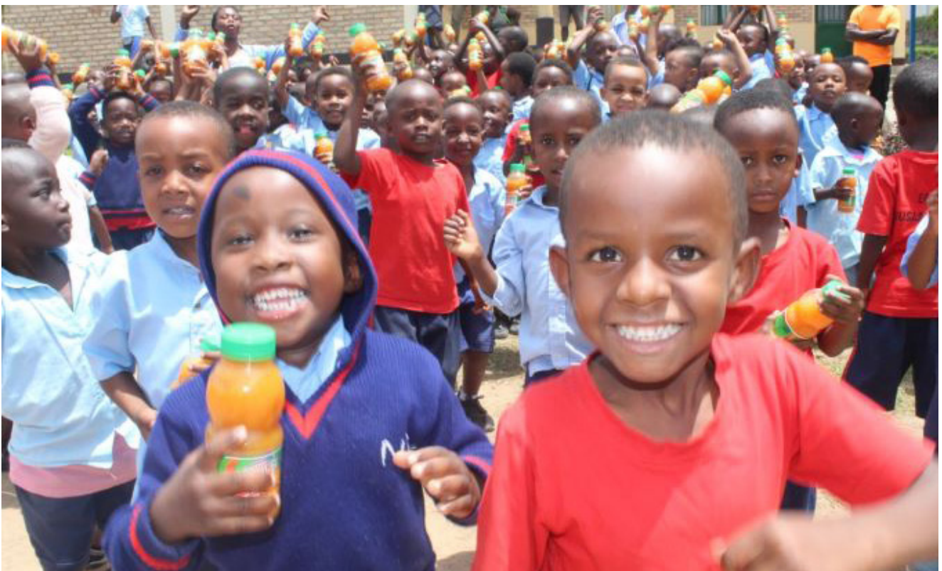
AAR organized children's Fun Event in Nyanza

The overall objective of this activity was to support children's talent development competitions in poems, drawings, songs, plays, games, and fun related activities and raise awareness of children's rights and issues affecting them in the community. The Fun event was an opportunity to share food and drinks, inspire their school retention and greater performance at school.