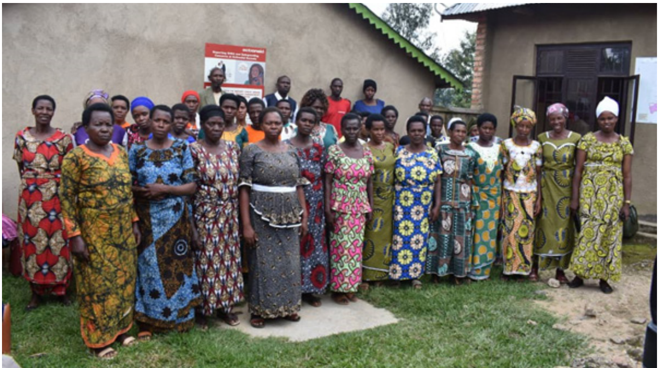
Women-Led Community-Based Protection committee members in Ruheru LRP

ActionAid has been contributing community-based protection efforts in times of emergencies and has now rolled out the Women-Led Community-Based Protection (WLCBP) approach in all its Local Rights Programme to enhance humanitarian action, emphasizing the essential role of women leaders in emergencies.