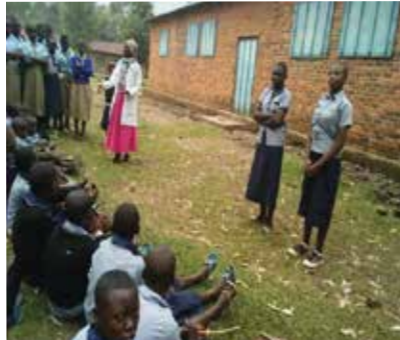
Abanyeshuri bitabiriye ingando bari kwigisha bagenzi babo batazitatirye.

Muri Nzeri 2022, mu murenge wa Muko, habereye umwihereho w'iminsi itatu wari wateguwe na ActioAid Rwanda witabirwa n'abana b'abakobwa 200 baturuka mu ishuri rya Kabere. Bahigiye ubumenyi butandukanye bugamije kuzamura imyumvire yabo, gusobanurirwa uburenganzira ku buzima bw'imyororokere, kwiga ku kibazo cy'inda ziterwa abangavu no kuganira ku mategeko arengera abana n'abagore muri rusange.