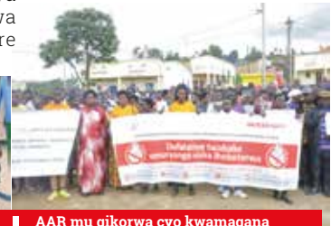
AAR mu gikorwa cyo kwamagana ihohoterwa rishingiye ku gitsina mu gihe cy'iminsi 16

Guteza imbere uruhare rw'umugore n'umukobwa mu miyoborere, ifatwa ry'ibyemezo no gushyiraho politiki.