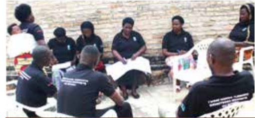
AAR yahuguye abagore 621, ku burenganzira bwa muntu, kurwanya ihohoterwa rishingiye ku gitsina no gukemura amakimbirane.

Uburyo aya mahugurwa yakozwemo kwari uguhugura abazahugurwa abandi no kongerera ubushobozi inama y'igihugu y'abagore kugirango bazafashe kugeza ubumenyi bahawe ku bandi bagore bahura na bo muri gahunda zabo za buri muni. Abahawe amahugurwa bigishijwe amategeko n'ubundi bumenyi bufasha mu guhangana n'ikibazo cy'ihohoterwa rishingiye ku gitsina.