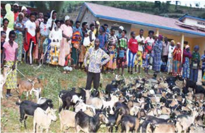
Ku matariki ya 25 - 29 Nyakanga 2022, abagenerwabikorwa ba AAR babarizwa mu mirenge ya Gitesi na Murundi bahawe ihene.

Taliki 19 Nyakanga 2022, AAR ku nkunga y'ikigo cy'abongereza gitsura amajyambere (UKAID), kuri Hotel Chez Lando i Kigali yateguye igikorwa kigamije gusobanura uburenganzira ku buzima bw'imyororokere n'ihohoterwa rishingiye ku gitsina. Hari ku bufatanye n'umuryango w'aba Guides mu Rwanda (AGR) n'umuryango Faith Victory.