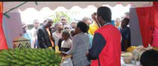
AAR yubakiye abahinzi bo muri Nyanza isoko ry'imyaka

Kubonera isoko umusaruro no guhabwa serivisi z'ishoramali.