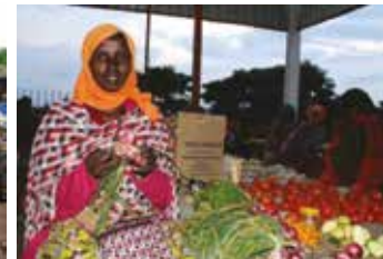
AAR yafashije abagore bakora ubuhinzi buciriritse kubona isoko ry'umusaruro wabonetse

Kubonera isoko umusaruro no guhabwa serivise z'ishoramali.