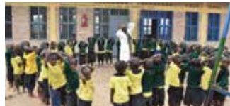
AAR yafashije abaturage kubaka irerero ry'abana

Intego 1.2: Guha agaciro, gusaranganya, no kugabanya imirimo yo mu rugo idahabwa agaciro ihariwa abagore n'abakobwa.