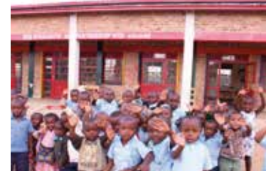
Irerero rishya rya Nyakabuye ryubatswe mu murenge wa Mukingo, Akarere Nyanza

Mu guhangana n'icyo kibazo kandi cy'imirimo yo mu rugo iharirwa abagore n'abakobwa, AAR yateguye ikiganiriro ku rwego rw'igihugu kibanda gusa ku mirimo yo mu rugo iharirwa abagore n'ingaruka bifite ku iterambere ry'umugore