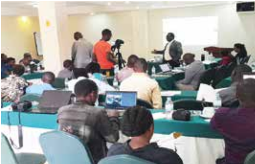
Inama yari igamije gusuzumira hamwe amakuru mbanzirizamushinga ku ngaruka Covid 19 yagize ku batagira kivugira mu ifatwa ry'ibyemezo

Ku itariki 23 Ukwakira 2022, AAR yateguye igikorwa kigamije gusuzumira hamwe ingaruka za Covid-19 ku ruhare rw'abatagira kivugira mu gihe cyo gufata imyanzuro. Iki gikorwa cyakozwe ku nkunga y'umuryango mpuzamahanga uharanira iyubahirizwa ry'amategeko (ICNL) hagamijwe gushishikariza abagore, urubyiruko, abana, abayobozi b'amadini, abafite ubumuga, abikorera ku giti cyabo ingimbi, n'abangavu, abasaza ndetse n'abandi badakunze guhabwa umwanya ngo bagire uruhare muri gahunda zifata ibyemezo no gushakira hamwe ibisubizo ku ngaruka za Covid-19.