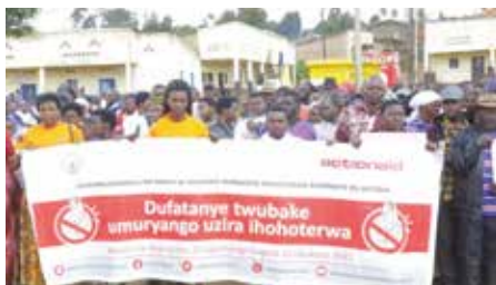
Muri werurwe 2022, AAR yifatanyije n'abaturage bo mu karere ka Nyaruguru mu gikorwa cyo kwamagana ihohoterwa rishingiye ku gitsina.

Hifashishijwe inkunga ActionAid Rwanda yabonye zigamije gushyigikira ibyo bikorwa, abantu 43,101 baturuka hiryana no hino mu gihugu, bahuguriwe uburyo bwo kurwanya ihohoterwa iryo ari ryose rikorerwa umugore. Ubusanzwe twifuzaga guhugura abantu 46,160