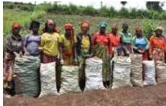
AAR yafashije amashyirahamwe y'abagore kubona imbuto n'inyongera musaruro, ubu barishimira umusaruro

Guteza imbere ubuhinzi bubungabunga urusobe rw'ibinyabuzima n'ibidukikije ku buryo burambye