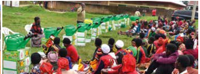
Abahinzi bo muri Ruheru nabo bahawe ibikoresho byo kuhira imyaka