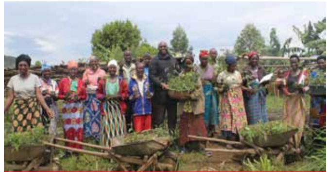
AAR yafashije amashyirahamwe 72 y'abagore mu gutegura ingemwe zifashishwa mu kuzahura amashyamba mu rwego rwo guhangana n'ihindagurika ry'ikirere