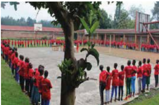
Ingando z'abakobwa zabereye mu Murenge wa Muko