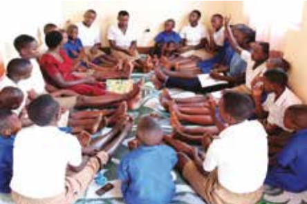
AAR ishyiraho umwanya abakobwa bisanzuriramo biga ib'ubuzima bw'imyororokere.

Mu mwaka wa 2022, ActionAid Rwanda yakoze ubukangurambaga bugamije kwigisha abana uburenganzira bwabo no gushishikariza abakobwa kwigirira icyizere bakajya mu nzego z'ubuyobozi, inzego zifata ibyemezo n'izishyiraho itegeko. Mu rwego rwo kugeza ubu butumwa ku bana benshi, ActionAid Rwanda yateguye: ibiganiro-mpaka, amarushanwa yo kugaragaza impano, imikino itandukanye n'ibindi.