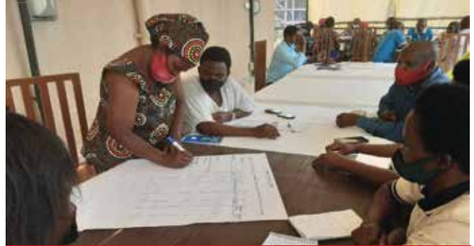
Abahinzi bigishijwe gukora ifishi ibafasha kwisuzuma ngo bajye bareba uko bahagaze niba bari gutera imbere

ActionAid Rwanda ku bufatanye na Vi-Agroforestry bafashije kwibumbira mu mashyirahamwe abahinzi 7,477 bakora ubuhinzi bwo kwikenura, maze bakora amashyirahamwe atatu, bahabwa amahugurwa ku buhinzi butanga umusaruro no kugenderana n'abandi bakora umwuga umwe bo mu turere baturanye hagamijwe kwiga no kungurana ubumenyi. Iyo gahunda yabafashije kugira amahirwe yo guhura n'abayobozi b'inzego z'ibanze ndetse n'inzego z'igihugu babasha gutanga ibitekerezo n'ibiyifuzo byabo ku mwuga bakora w'ubuhinzi buciriritse.