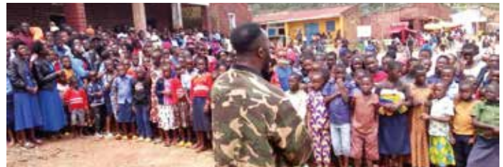
AAR yakoze ubukangurambaga mu Karere ka Karongi bugamije gusobanura uburenganzira ku buzima bw'imyororokere.

ActionAid Rwanda, ku bufatanye n'umuryango udaharanira inyungu Faith Victory Association, hamwe n'abayobozi b'amashuri bafatanyirije hamwe gushyiraho amatsinda mato abana bigiramo utuntu n'utundi (Clubs), hagamijwe kubongerera ubumenyi n'ubushobozi ku bintu bitandukanye bihangayikishije. Ayo matsinda abasha gukorera mu bigo by'amashuri ndetse no hanze yabyo. Amatsinda yakozwe yose hamwe ni 60 agahuzwa abantu 1800, muri bo 1200 ni igitsina gore, na ho 600 ni igitsina gabo.