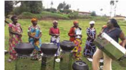
Abagenewabikorwa bo mu Murenge wa Ruheru, bahawe Rondereza.

ActionAid Rwanda yafashije imiryango 273 mu gihe hari hateganyijwe 210, ihabwa imbabura zirondereza ibicanwa kandi zihisha vuba n'ibikoresho bibika ibyo kurya mu gihe kirekire. Iyi gahunda yabagiriye akamaro kuko igihe batetse babasha gukora n'indi mirimo kandi ibyo kurya bishya vuba bakajya no mu bindi bikorwa bibafitiye inyungu. Ibi bikoresho kandi bifite ubushobozi bwo kubika ibyo kurya mu gihe kirekire. Ikoreshwa ry'aya mashyiga abika umuriro, rigabanya gukoresha inkwi nyinshi bityo bigafasha no mu kubungabunga ibidukikije. Abafashijwe ndetse n'ubuyobozi bw'inzego z'ibanze bishimiye cyane iyi gahunda.