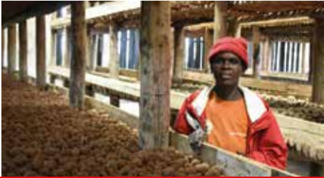
AAR yafashije abahinzi gutubura imbuto y'ibirayi

Guteza imbere Ubuhinzi bubungabunga urusobe rw'ibinyabuzima n'ibidukikije ku buryo burambye