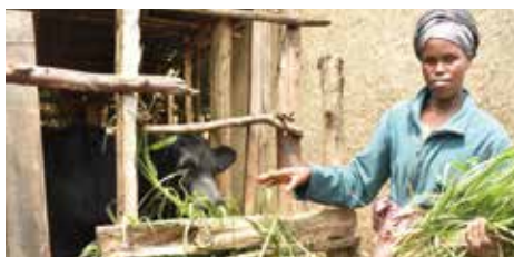
AAR yafashije abagenerwabikorwa kubona amatungo abafasha kubona ifumbire no kongera umusaruro

Hakozwe ubukangurambaga, ibiganiro ku ma radiyo na televiziyo bigamije kurengera inyungu z'umugore no kurwanya ihohoterwa rishingiye ku gitsina, twifatanyije n'abagore kwizihiza umunsi mpuzamahanga wahariwe umugore, umunsi mpuzamahanga wahariwe umugore wo mu cyaro, n'umunsi w'umwana w'umunyafurika.