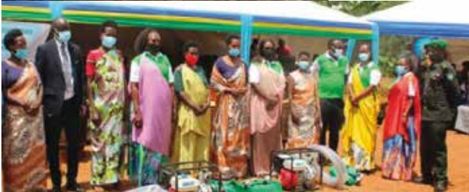
AAR yafashishije abahinzi imashini zo kuhira imyaka

Ku musozo w'amahugurwa, ActionAid Rwanda yahaye ibikoresho by'ubuhinzi n'inyongeramusaruro abari bamaze igihe bigishwa, kugira ngo bibafashe gushyira mu bikorwa ibyo bize, maze basabwa kujya bakoresha ubwo bumenyi mu bikorwa by'ubuhinzi bwabo haba mu mashyirahamwe ndetse n'ubuhinzi ngandururugo bakorera mu miryango yabo.