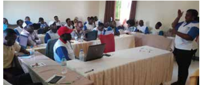
Abanyamakuru bahawe amahugurwa ku mirimo yo mu rugo ikunze guharirwa abagore

Ku bufatanye n'umuryango wa Loni uharanira inyungu z'umugore UNWOMEN Rwanda, ActionAid Rwanda yateye inkunga igikorwa kigamije kuzana impinduka zigamije guha agaciro, gusaranganya no kugabanya imirimo yo mu rugo ikunze guharirwa abagore kugira ngo na bo bagire uruhare mu zinda gahunda z'ubukungu . Uyu mushinga wamaze amezi agera kuri atandatu kuva muri Gicurasi kugeza mu kwakira umwaka wa 2022. Bitewe n'uko hari byinshi byari bikomeye gukorwa kuri uyu mushinga, igihe cyari giteganyijwe kiyongeyeho andi mezi abiri.