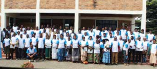
Abavuga rikijyana bahawe amahugurwa ku mirimo yo mu rugo ikunze guharirwa abagore