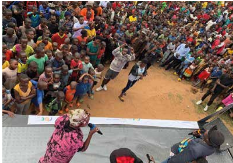
AAR yateguye ibikorwa bihuriza abantu hamwe bigamije guharanira uburenganzira ku buzima bw'imyorokere, mu karere ka Karongi.

Nyuma yo gukora amatsinda mato yo kungurana ibitekerezo no kwigiramo utuntu n'utundi, no guhana amakuru, ActionAid Rwanda ku bufatanye n'umuryango Faith Victory Association, abayobozi b'inzego z'ibanze n'abayobozi b'ibigo by'amashuri twashyizeho itsinda ry'abahagarariye abandi ku rwego rw'igihugu rishingiye gukora ubuvugizi ku burenganzira bwa muntu no ku buzima bw'imyorokere, bahabwa amahugurwa kandi bongererwa ubushobozi kugira ngo bajye hirya no hino mu rungano bafatanye guharanira uburenganzira bushingiye ku buzima bw'imyorokere.