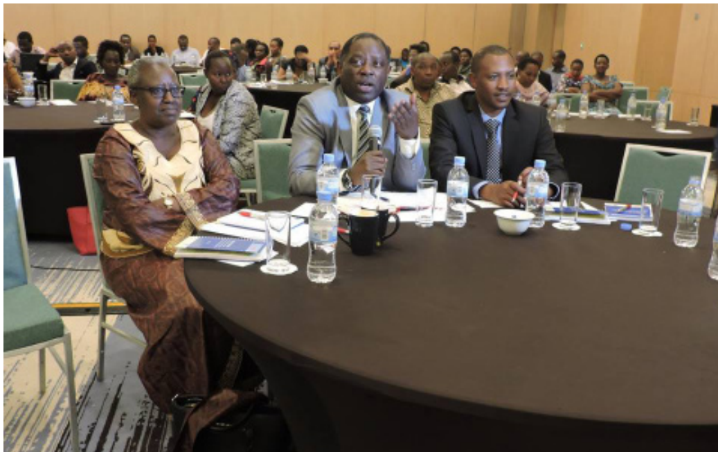
Minister Nsengiyumva (in the middle) sharing his views during the public dialogue

feedback to national institutions which gives them the opportunity to adjust their programs to better suit farmer’s needs.