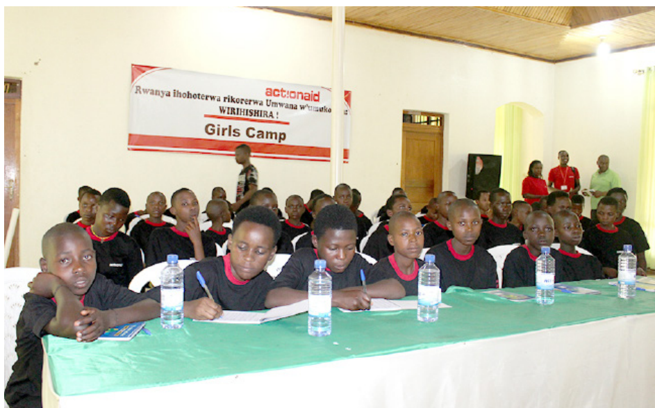
Participants busy taking notes during one of the girls' camp session

Murekatete also pledged to share what she had learned with other girls in her village who weren't able to attend the Girls Camp.