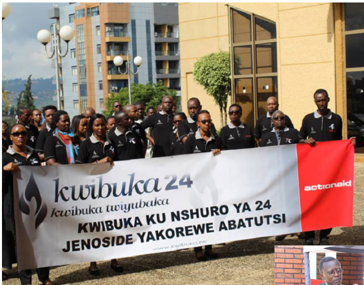
AAR staff visiting the Campaign against Genocide Museum (CAG Museum) at the Rwanda Parliament in honor of the victims of the 1994 Genocide against the Tutsis

ActionAid Rwanda (AAR) staff recently paid homage to the victims of 1994 Genocide against Tutsi, that also claimed lives of some of its former staff members during that dark period.