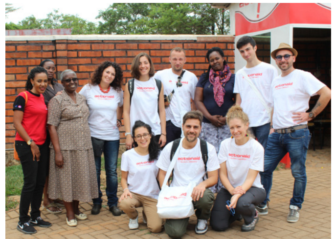
Italian supporters pose for a group photo with some of the staff at ActionAid Rwanda offices

“ActionAid Rwanda is one of the best performers in this district. AAR has greatly improved the area of education in Gisagara district. We now have ECDs built by ActionAid, they have built classrooms, they work hand in hand to support the transformation of the rural woman and girl child. Through their support; children are able to attend school and now we have the lowest rate of dropouts in the district than we have ever had. We truly appreciate the work they do here and in the other districts they operate,” Gasengayire emphasized.