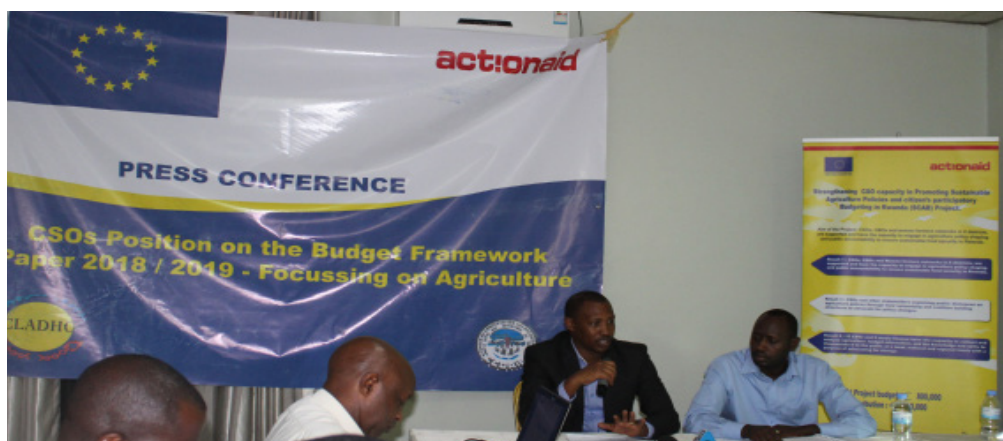
Sekanyange, the Civil Society Platform & CLADHO Chair person addressing the media during the Press conference

Civil Society organisations also called for transformation of milk collection hubs to act as one stop center for farmers to acquire services such as animal vaccines, animal drugs and fertilizers.