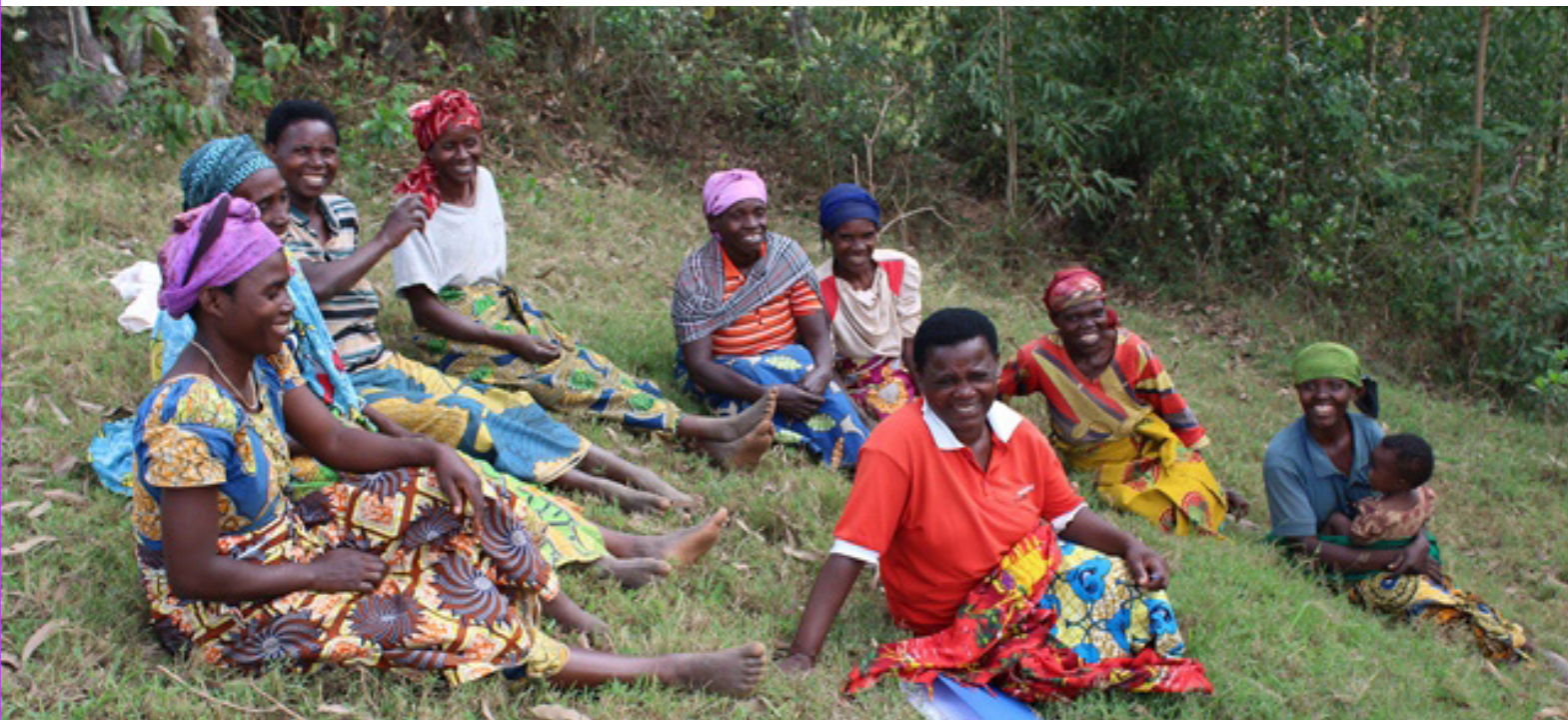
Tuzamurane cooperative members sharing a light moment during one of their meeting sessions

Tuzamurane Cooperative is among cooperatives that have been supported by ActionAid Rwanda in Murundi Sector, Karongi District. The cooperative was supported with livestock and received skills development trainings to improve the livelihood of its 29 members who were living below the poverty line of one dollar a day. AAR also gave trainings on Gender Based Violence prevention, property rights, as well as women's rights.