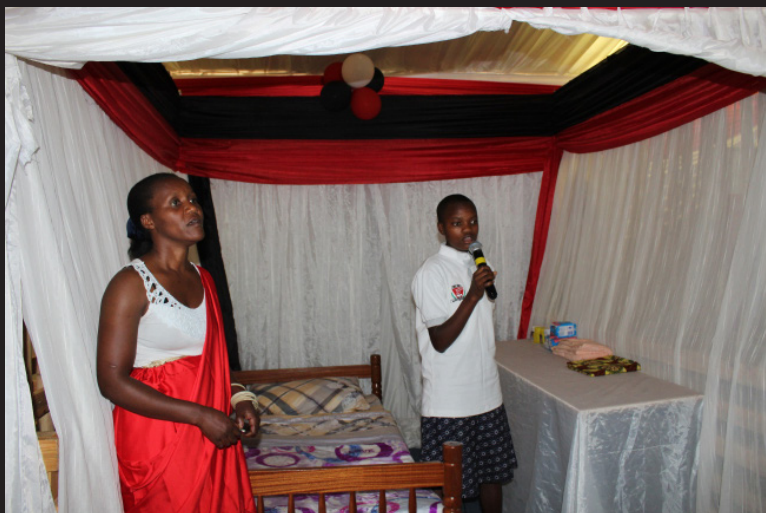
A girl explains to the bystanders how she and others are benefiting from the girls' rooms