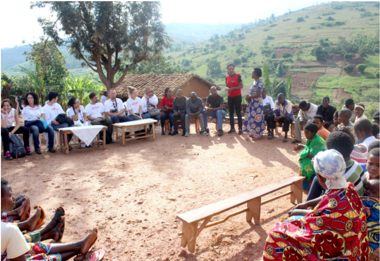
Italian supporters interacting with the community members in Nyanza LRP during their visit