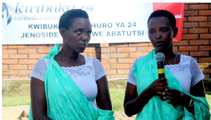
AAR Right holders, also Genocide survivors sharing their testimony during the AAR Kwibuka 24 commemoration vigil