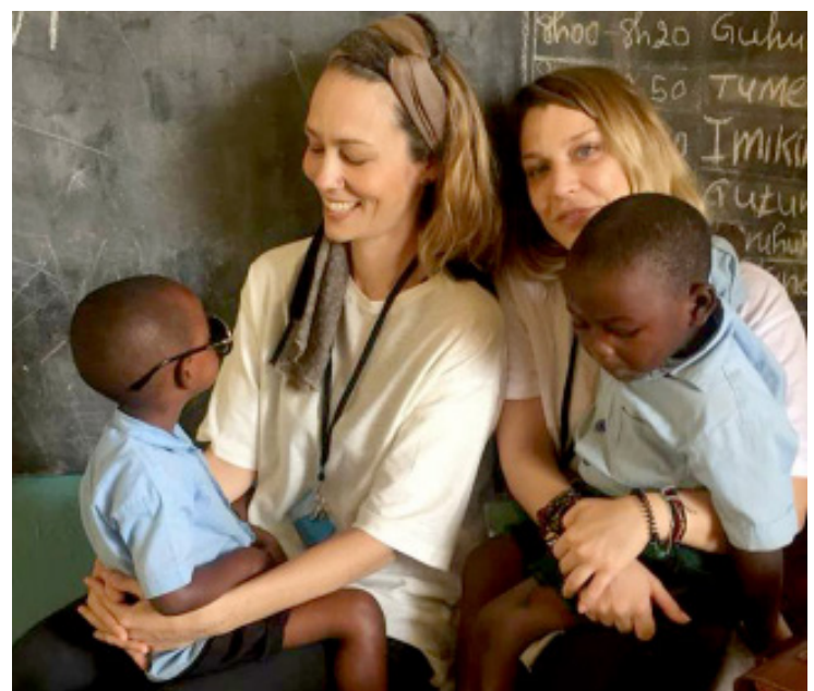
Greek supporters having a light moment with children at one of the ECDs in Gitesi sector