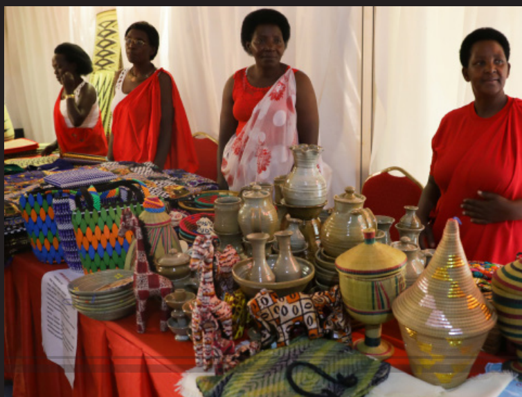
Rightholders happily display some of their work that generates income for them