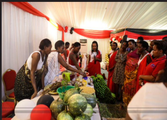
Rightholders exhibiting some of their work to the visitors at the 35 years event