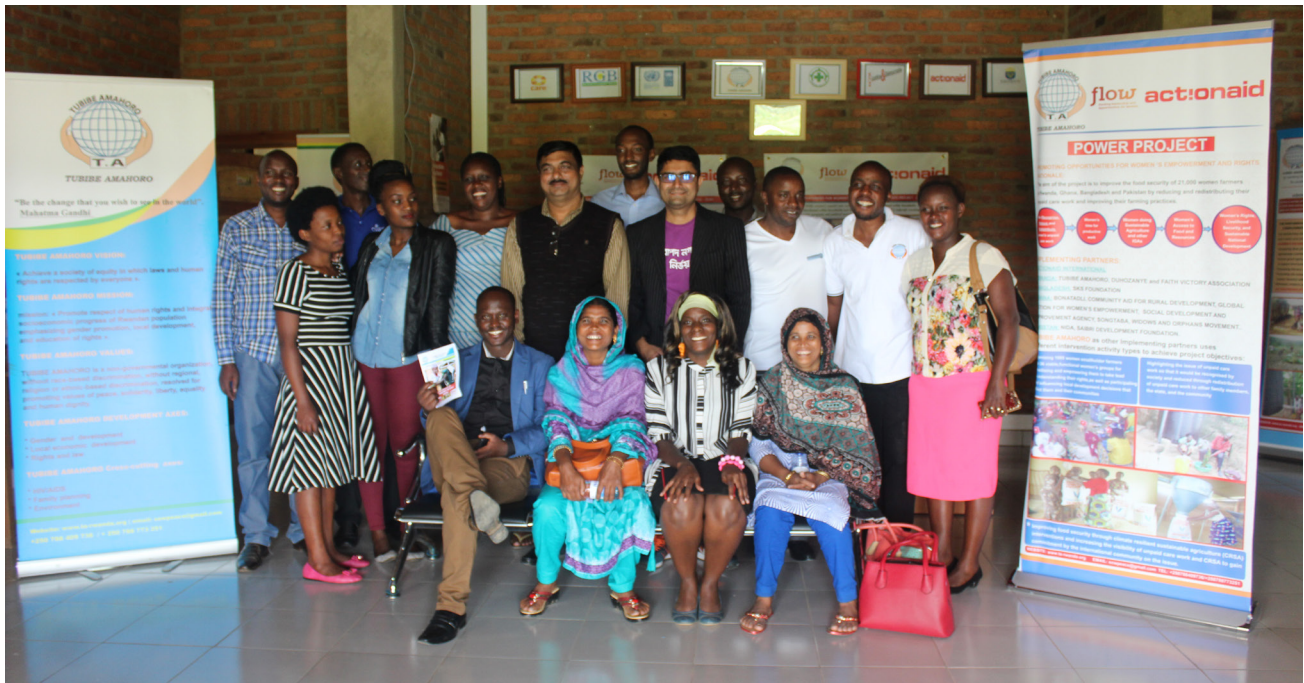
Bangladesh smallholder farmers visiting Tubibe Amahoro Association, one of AAR partners working along with the Power project

them as business women thus helping them get out of poverty and providing the people of Gitesi employment.