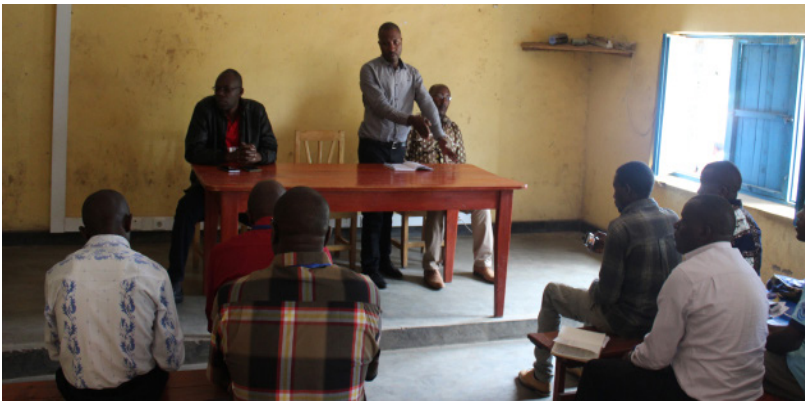
CLADHO meeting with district officials for the community scorecard reevaluation in Musanze district

CLADHO in partnership with ActionAid Rwanda and CCOAIB implements the community score card and social audit as highlighted in the “capacity building project that aims at promoting Sustainable Agriculture Policies and Citizens participatory Budgeting in Rwanda (SCAB project)” funded by the European Union.