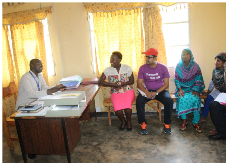
Bangladesh women farmers engaging with Gitesi Executive Secretary to share insights from their visit