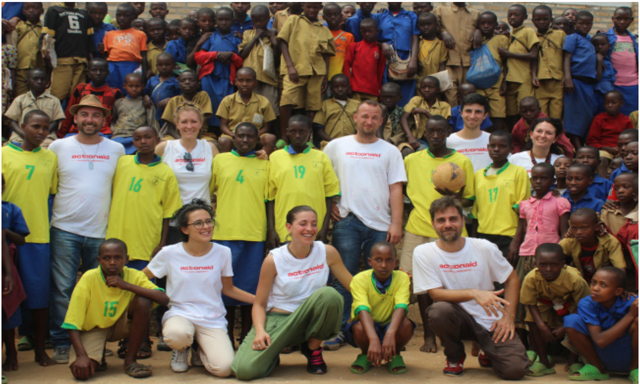
Italian supporters pose for a photo shoot before they play soccer with children in a Nyanza based school

“ActionAid Rwanda is one of the best performers in this district. AAR has greatly improved the area of education in Gisagara district. We now have ECDs built by ActionAid, they have built classrooms, they work hand in hand to support the transformation of the rural woman and girl child. Through their support; children are able to attend school and now we have the lowest rate of dropouts in the district than we have ever had. We truly appreciate the work they do here and in the other districts they operate,” Gasengayire emphasized.