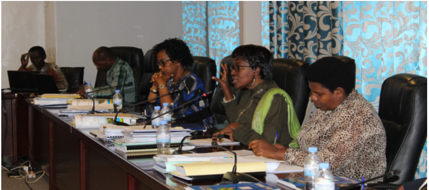
The Parliamentary budget committee gives feedback to the Civil Society Platform during the BFP presentation

The Civil Society platform under the leadership of CLADHO, recently submitted and presented their feedback and concerns regarding the Budget Framework Paper(BFP) 2018/2019 to the Parliamentary Budget Committee.