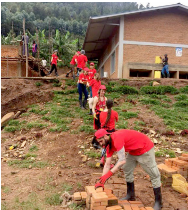
Greek supporters helping with the construction of a school in Muvungu primary school, Gitesi sector

The Greek Volunteers also visited Gitesi ECD where they spent time with the children, played and interacted with them. The children were excited to spend time with the Greece volunteers.