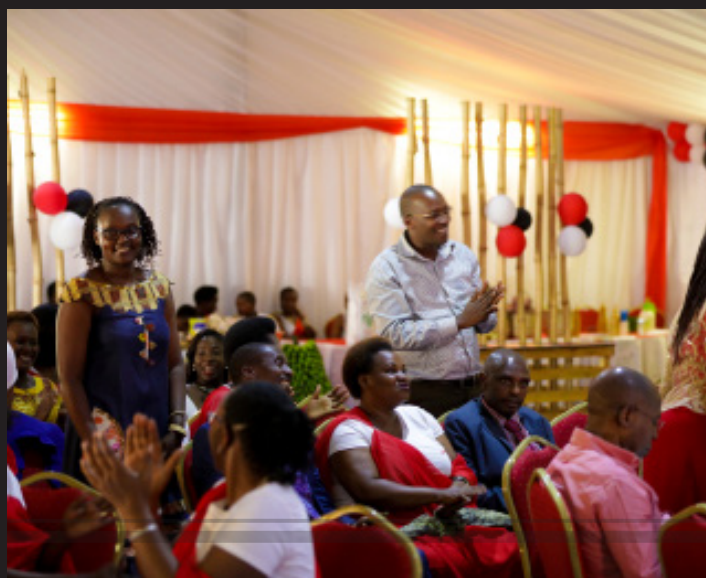
Former AA Rwanda staff standing up for appreciation of their contribution